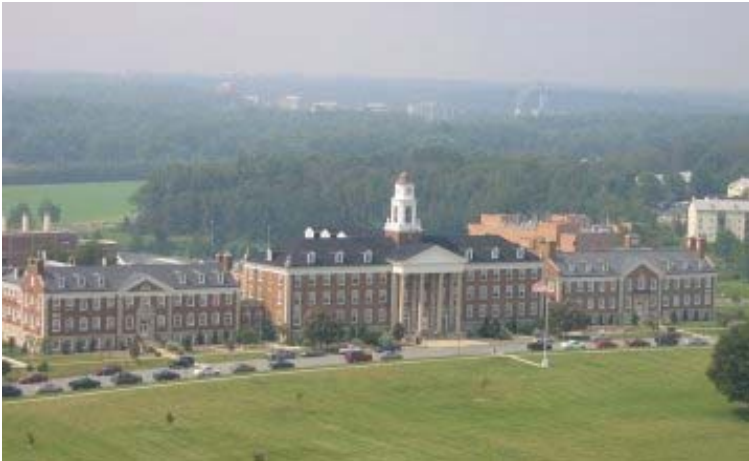
Beltsville Agricultural Research Center