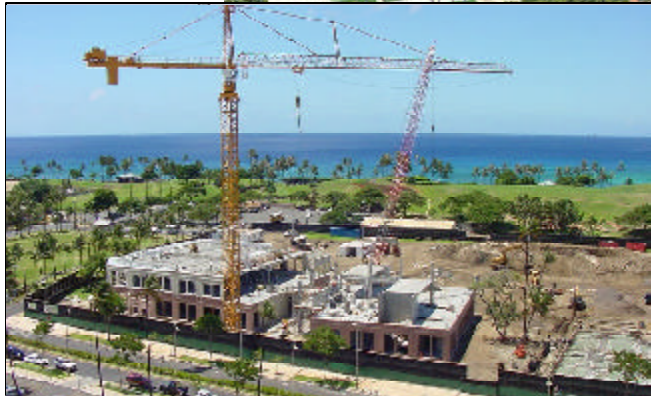
Above, a rendering of the John A. Burns School of Medicine complex and at left, the construction continues.