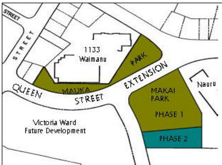
Above, a map showing the location of the Queen Street Park.

Another noteworthy project for which construction was started in late 2003 is the City and County of Honolulu’s new $12.7 million Headquarters Complex for the Honolulu Fire Department. Being developed on 1.603 acres of land at the intersection of Queen and South Streets, the Complex will include: a new 32,000 square foot Headquarters Building; a renovation of the historic Kaka’ako Fire Station (on South Street) into a Honolulu Fire Department Museum; a renovation of the existing Kaka’ako Fire Station (on Queen Street); and the development of a 50-stall parking lot. The new Headquarters Building will house all administrative functions of the Fire Department. The HFD Museum will house exhibits and displays, a retail sales counter for souvenirs; a meeting room and offices. Construction will take about two years to complete.