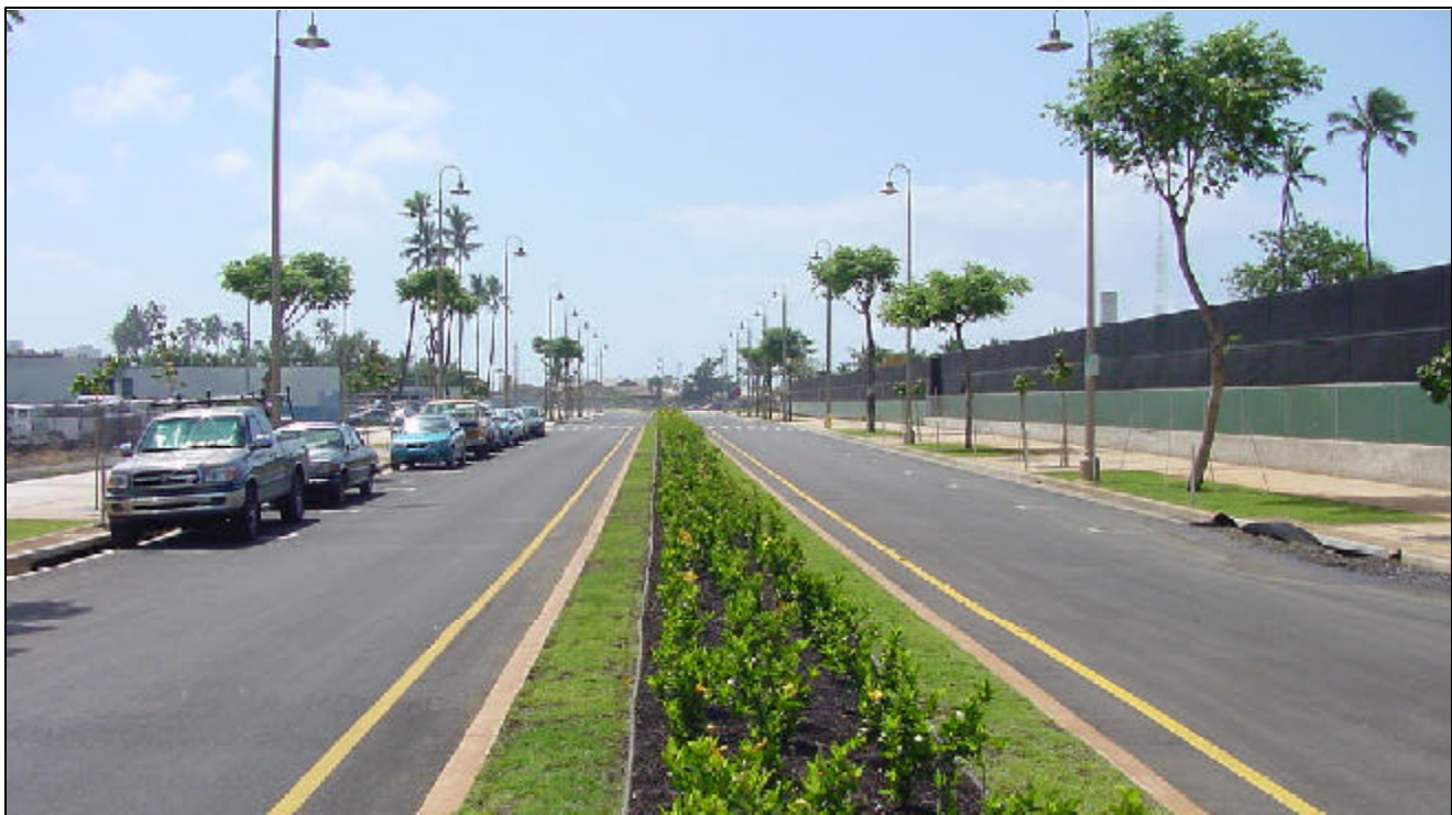
After improvements, Ilalo Street will be a beautifully landscaped boulevard that will serve as the principal collector street for the Waterfront.

Construction work on the second phase of infrastructure improvements on a portion of Kamakee Street (from Queen Street to Ala Moana Park Road) was completed by the end of 2002. This $11 million project, called ID-7, completed the installation of the last major drainage system in the Mauka portion of Kaka'ako. The project realigned Kamakee Street (between Auahi Street and Ala Moana Boulevard) and created a four-way signalized intersection at Ala Moana Boulevard and Ala Moana Park Road. The ID-7 Project has already improved traffic circulation through the Kaka'ako District and created a new,