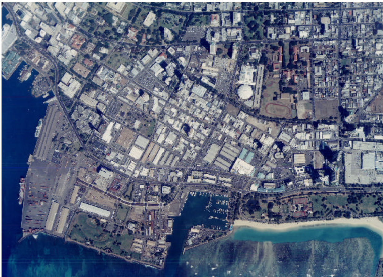
The Kaka'ako District is composed of 670 acres bounded by Piikoi, King, and Punchbowl Streets and Ala Moana Boulevard, and the stretch of waterfront from Kewalo Basin to Pier 4 in Honolulu Harbor.

The Hawaii Community Development Authority (HCDA) was established to supplement traditional community renewal methods by promoting and coordinating public and private sector community development. The 1976 State Legislature created the HCDA to plan for and to revitalize urban areas in the State which lawmakers find to be in need of timely redevelopment. These areas, designated as "Community Development Districts", were determined to be underused and deteriorating, but with the potential, once redeveloped, to address the needs of Hawaii's people and to provide economic opportunities for the State