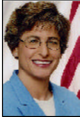
The Honorable Linda Lingle Governor State of Hawaii