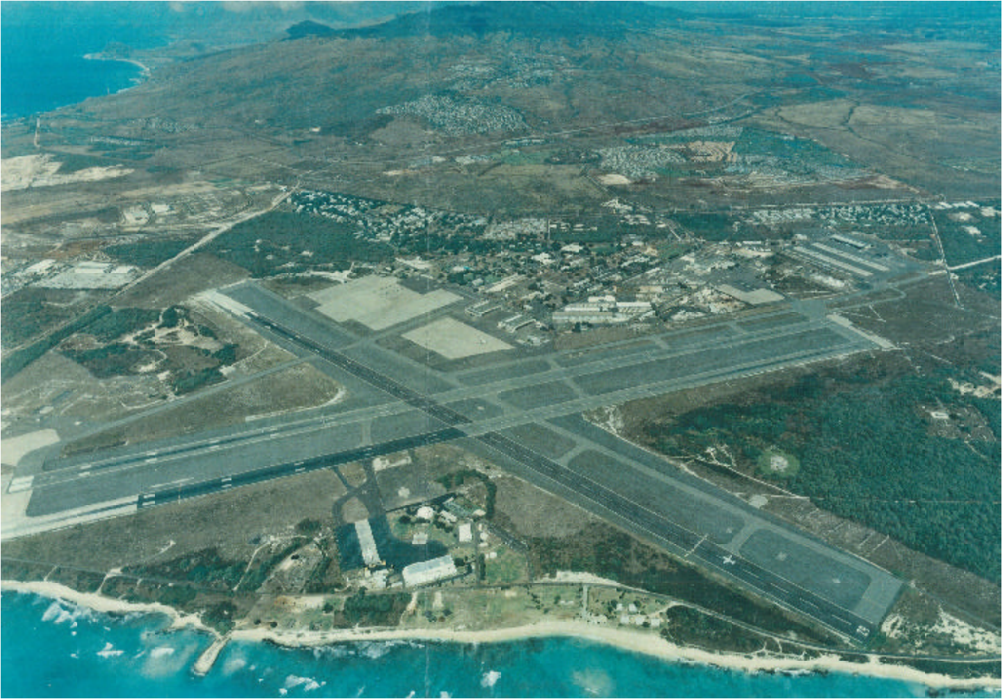
An aerial view of the Kalaeloa District.