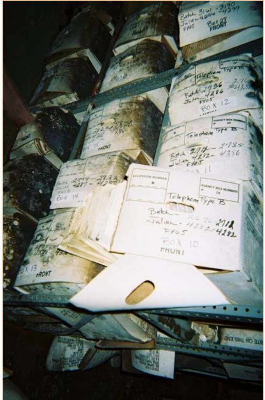
Damaged Records, Orleans Parish Criminal Court

On November 7, Document Reprocessors, a New York firm working under a FEMA contract, began the removal of records from the coroner's and court clerk's storage rooms in the basement of the Criminal Courts Building and file cabinets of records from the first floor