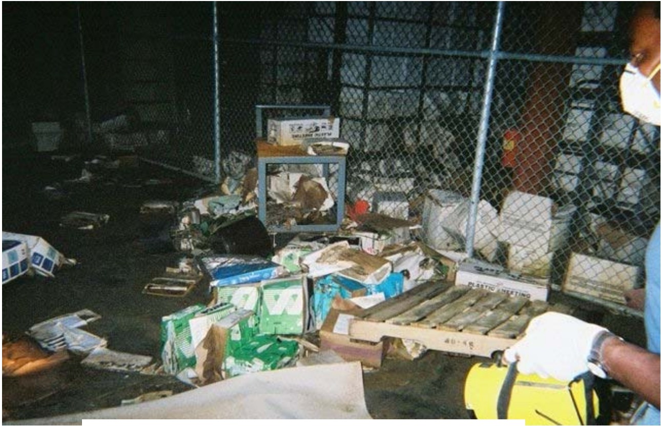
Damaged Records, Orleans Parish Criminal Court