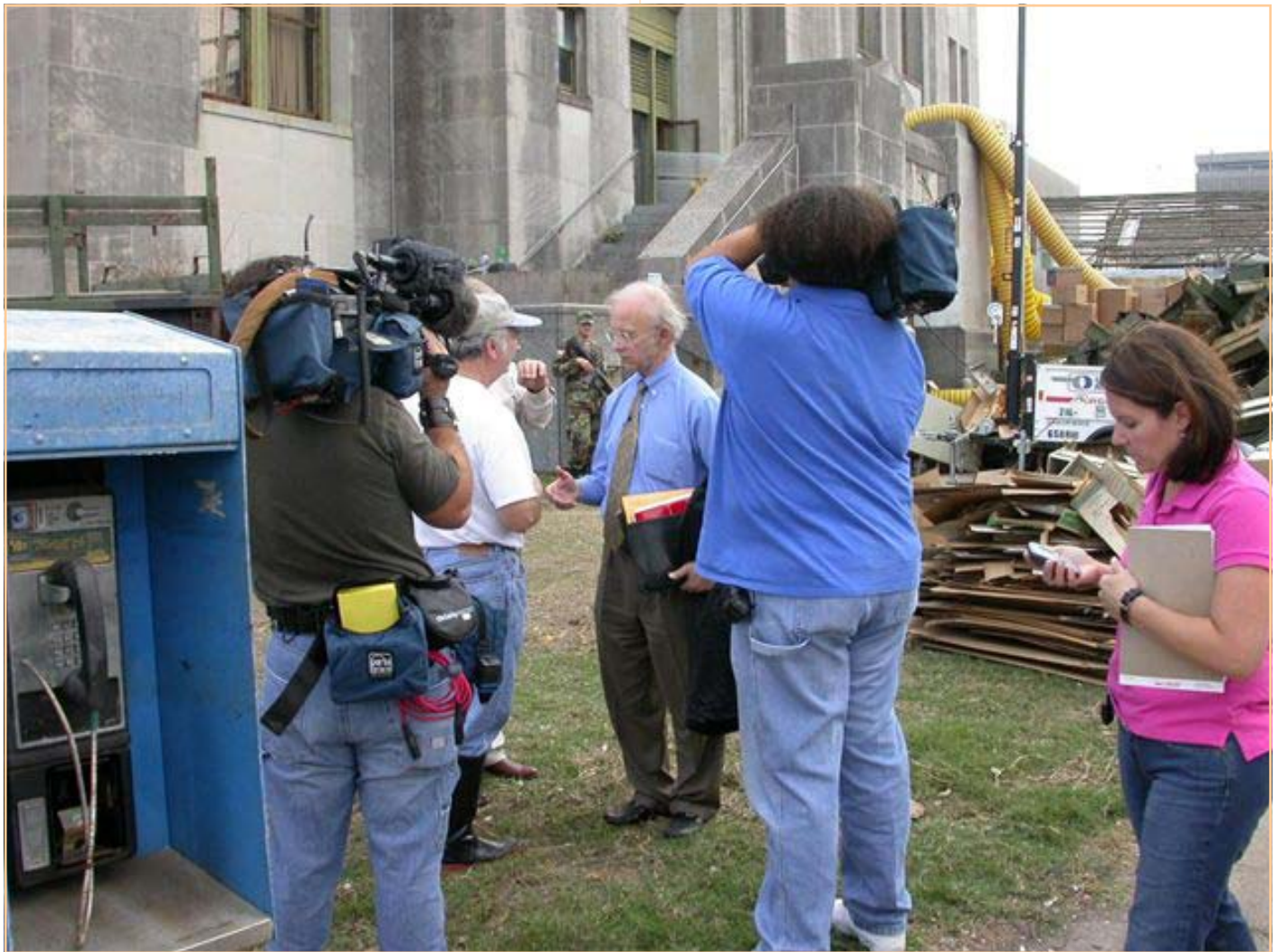
Dr. Allen Weinstein, Archivist of the United States visits clean up efforts in New Orleans.

There are many important lessons to be learned from catastrophic events like Hurricane Katrina. Federal, state, and local officials in Louisiana will be revisiting several emergency management issues, including maintenance of public safety and public health in a devastated city, procedures for evacuation and emergency responses, restoration of a community's infrastructure and its services, and actions to mitigate damage from future storms. Records management issues of storage, retention schedules, and protection of vital operating records should be part of the discussions.