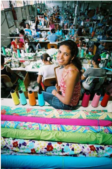
This Floor Manager of a small swimwear firm based in Bahia, Brazil, is working to help her business grow through exports. This is one of the several micro and small enterprises in the North and Northeast of Brazil receiving trade technical assistance from the U.S. Government through the U.S. Agency for International Development (USAID). In Brazil, USAID is demonstrating that further participation of small businesses in the country's exports has the potential to generate income and foster employment.