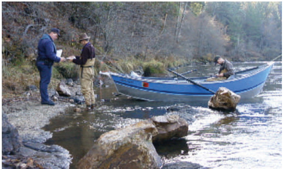
OSP F&W Trooper Checking Anglers for licenses and tags.