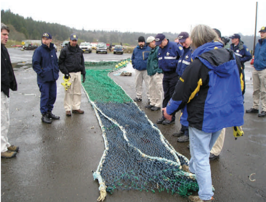
State and Federal Officers receiving training on trawl nets.

On June 7 & 8, 2007, twenty Oregon State Police, Fish and Wildlife Division troopers participated in a joint training session on federal fisheries issues, held in Astoria, Oregon at the United States Coast Guard (USCG) Air Station. This training brought together more than sixty enforcement officers from the natural resource enforcement agencies of the Washington Department of Fish and Wildlife, California Department of Fish and Game, NOAA/National Marine Fisheries Service - Office of Law Enforcement, USCG and the OSP. Training such as this provides a mechanism to bring state and federal officers together facilitating a unified enforcement effort towards West Coast recreational and commercial fisheries, along with valuable information sharing. Training subjects discussed covered the Pacific Fishery Management Council process, Vessel Monitoring System, Magnuson Stevens Fishery Conservation Act reauthorization, electronic fish tickets, fish identification, methamphetamine information, and discussions regarding various fisheries. Much thanks to NOAA who funded this joint training session.