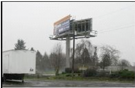
Center Mount V