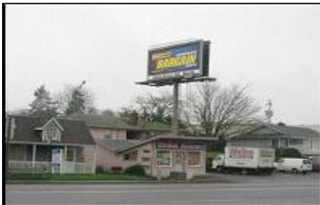
Center Mount, Back to Back