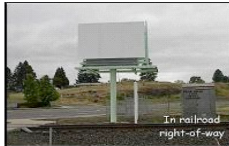
Center Mount V in Railroad Right-of-Way