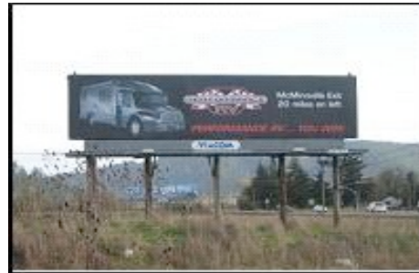
Multi-Post, Single Face