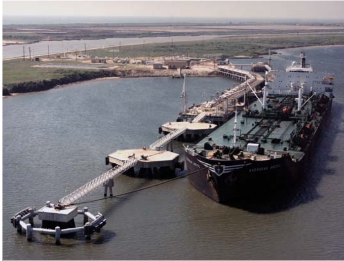
A barge docked at Phillips Terminal at the Strategic Petroleum Reserve

In order to evaluate these concerns, we conducted a review to determine whether the Department had analyzed all relevant data in selecting a site location for the expansion of the Reserve. Our review found that the Department and its contractor had in fact analyzed all available well and seismic data related to the Bruinsburg site and augmented this information with additional seismic tests. Additionally, we found that there are inherent uncertainties involved in the process of estimating the size of salt domes. As a consequence, the exact size and shape of the Bruinsburg salt dome is not fully known. Overall, we determined that the Department took the