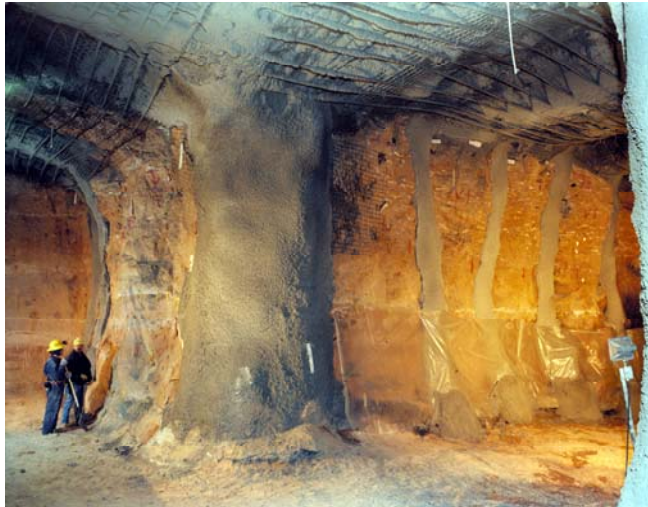
View of test tunnels at Yucca Mountain

uranium hexafluoride ( Follow-up of Depleted Uranium Hexafluoride Conversion , IG-0751, December 2006). We found that the Department had, in fact, performed an analysis in May 2005 that showed that adding the fourth line to the Portsmouth facility could result in the estimated savings indicated in our previous report. However, the Department had not taken the next step to implement the most cost-effective approach to converting depleted uranium into a more stable form. Despite the passage of time, we found that the Department could still save $35 million in lifecycle costs by reducing the operations schedule by approximately five years through the utilization of a fourth conversion line at the Portsmouth facility.