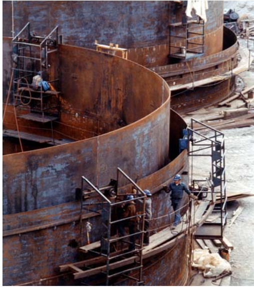
Cleanup of waste tanks at the Hanford Site

While these corrective actions are positive, recent OIG reviews have identified additional improvements that are necessary to ensure that the Department's efforts to implement project management principles are effective. For example, in one of the largest and most important of its environmental remediation projects, the Department is constructing a Waste Treatment Plant at the Hanford Site. The $12.2 billion facility is designed to treat and prepare for disposal of 53 million gallons of radioactive and chemically hazardous waste. Given its classification as a Category II nuclear facility, the Waste Treatment Plant must meet quality assurance standards for nuclear facilities, which significantly exceed those required for commercial facilities. As a result, the design called for the installation of a computerized integrated control network to monitor the operation of a number of key processes of the Plant.