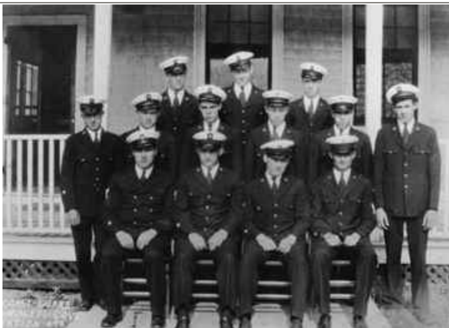
"U.S. COAST - GUARD - SPERMACETI - COVE - STATION - 1930"; no photo number; photographer unknown.