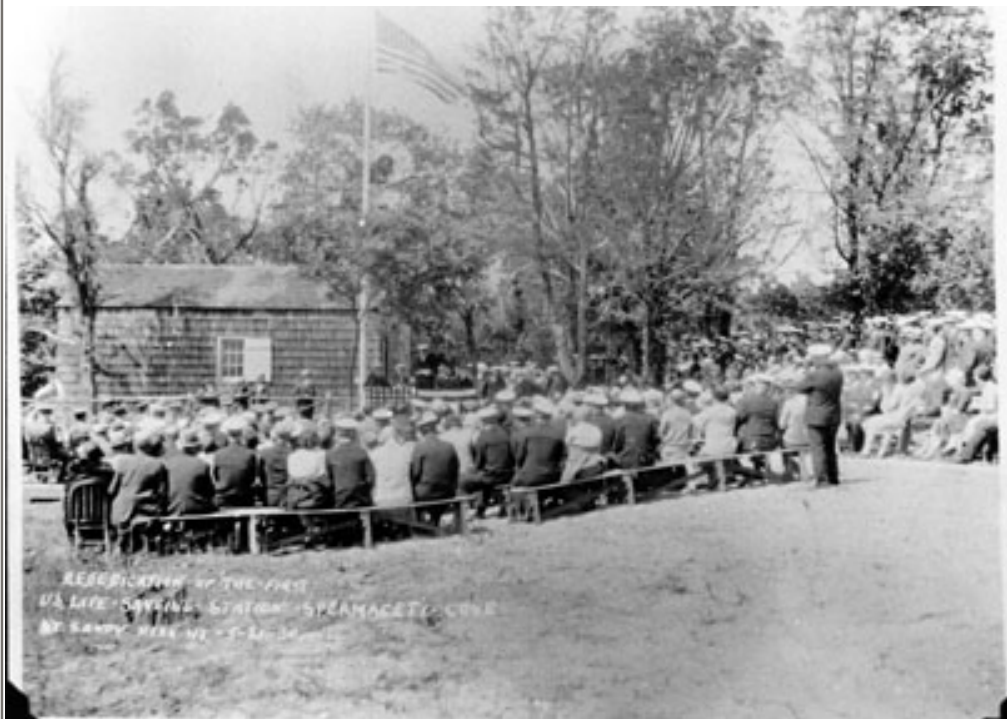
"REDEDICATION OF THE FIRST U. S. LIFE - SAVEING [sic] STATION - SPERMACETI COVE AT SANDY HOOK, N.J. - 5- 21- 30."; no photo number; photographer unknown.