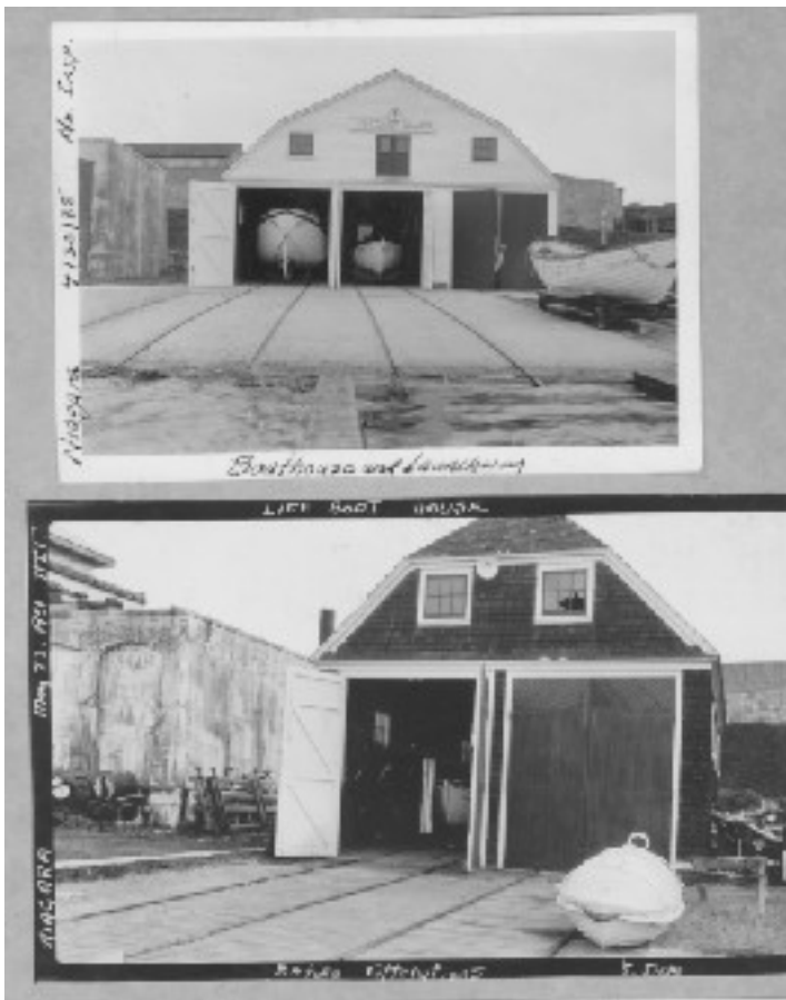
Upper photo: "Boathouse and Launching."; 1935; no photo number; photographer unknown.