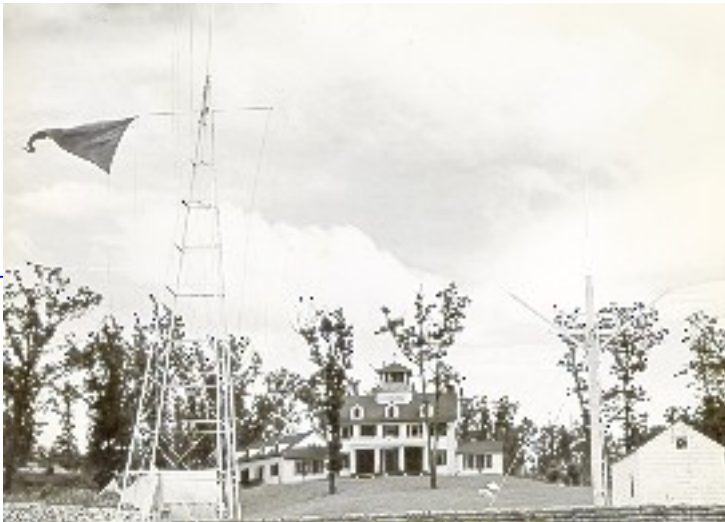
"Eatons Neck Lifeboat Sta. #94 Long Island, N.Y., 3rd CG. District, 1941."; no photo number; photographer unknown.