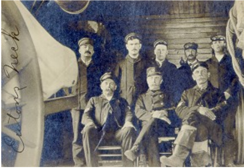
"Old Photo, Eatons Neck."; no date/photo number; photographer unknown.

The keeper and crew of the Eatons Neck Life-Saving Station, circa 1900.