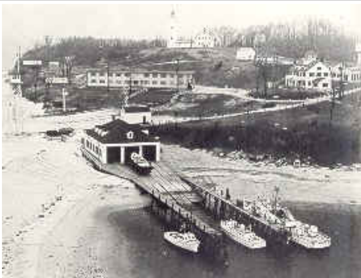
"Eatons Neck Lifeboat Sta. #94 Long Island, N.Y."; photo dated June, 1950; no photo number; photographer unknown.