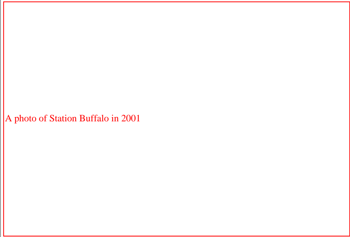
A photo of Station Buffalo in 2001