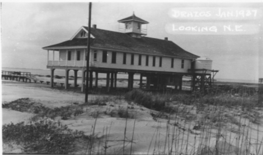
BRAZOS JAN 1937 LOOKING N.E.

WEST 75.18% COMPLETED."; Photo by J. C. Ocker, taken 4 July 1923; no photo number.