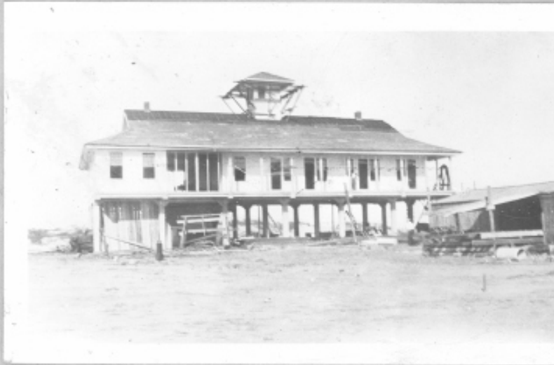
VIEW LOOKING FROM THE WEST 75.18% COMPLETED

WEST 75.18% COMPLETED."; taken 4 July 1923; no photo number.