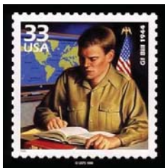
GI Bill Postage Stamp circa 1999

For more information on VA education benefits, contact your county veterans' service officer (see page 12), or contact ODVA at 800-692-9666.