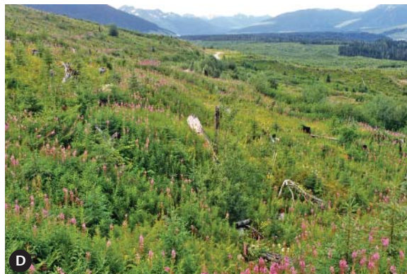
FIGURE 3 Walker Creek site (Block 5) – (A) 1986, pre-burn, (B) June 1987, 1 year after burning, (C) 1991, 5 years after burning, (D) 1996, 10 years after burning.