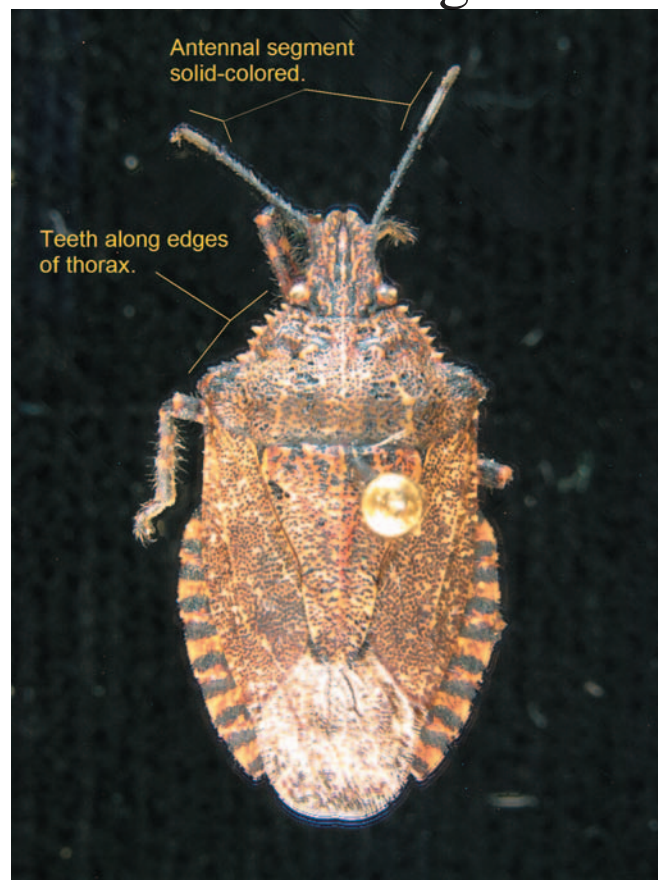
A Rough Stink Bug, Brochymena quadripustula .

An invasive exotic insect pest new to the Pacific Northwest, the brown marmorated stink bug (BMSB), Halyomorpha halys (Heteroptera: Pentatomidae), was recently found in Oregon. A single specimen was collected August 4, 2004 in samples from a woodboring insect trap placed in the Ladd's Addition neighborhood of Portland. As of mid-February, 2005, 6 additional specimens have been found, all from Portland and it is believed that BMSB is truly established in Oregon.