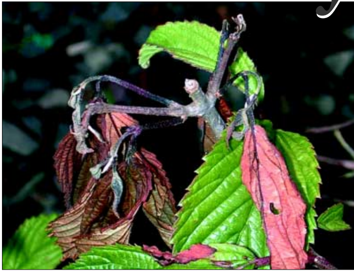
Figure 1.— Ramorum shoot dieback and leaf blight on Viburnum x bodnantense 'Dawn'.

A newly described funguslike organism named Phytophthora ramorum was discovered in 1993 to cause leaf blight, stem canker, and tip dieback on nursery-grown rhododendrons and viburnums in Germany and the Netherlands. At about the same time, many tanoaks ( Lithocarpus densiflorus ) and oaks ( Quercus sp.) in the San Francisco Bay Area were dying from a new disease. The cause of this “sudden oak death” was also Phytophthora ramorum .