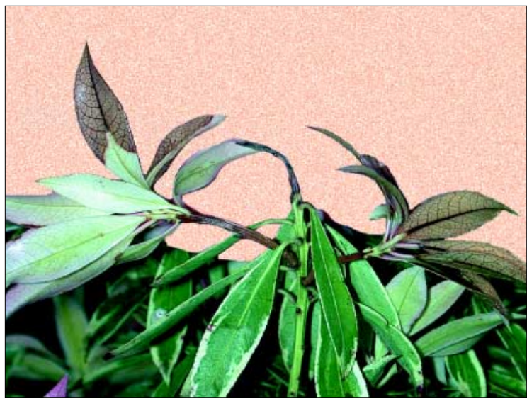
Figure 7.—Leaf and stem necrosis and shoot dieback on Pieris japonica .