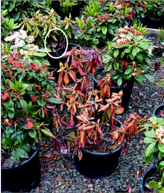
Figure 10 (above left).—Rhododendron 'Unique' plants with ramorum leaf blight. Plant in center foreground was killed by ramorum leaf blight; plant in background shows early symptoms of ramorum leaf blight on lower leaves.