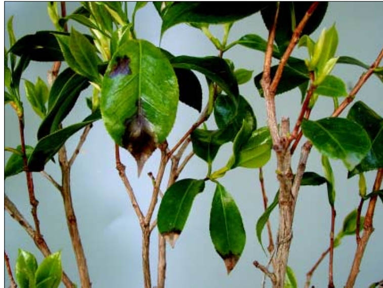
Figure 6 (far right).—Leaf spots on Camellia japonica caused by P. ramorum .

Figure 5 (near right).—Symptoms on Camellia include leaf lesions and defoliation.