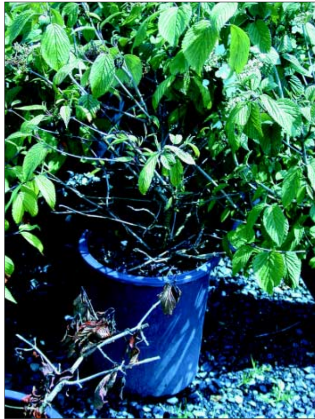
Figure 3 (above).— Viburnum plicatum var. tomentosum ‘Mariesii’ infected with P. ramorum , showing a necrotic leaf as well as defoliation near the base of the plant.

Phytophthora ramorum is a funguslike organism well adapted to the cool, wet conditions of the Pacific Northwest and at the same time tolerant of heat and drought. Unlike most Phytophthora species that infect roots, P. ramorum is mainly a foliar pathogen. It produces several spore types, which helps the organism survive and spread (Figure 4). Spores landing on wet leaves or stems germinate and infect the plant. Young leaves are especially susceptible. Within a few days, sporangia are produced, and they release tiny,