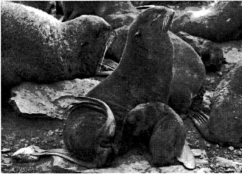
An adult female northern fur seal nurses her pup. Lactating northern fur seals conduct cyclic feeding trips averaging 2.5 days on shore to feed their young and 5.9 days at sea to feed.

the role of diet in the declining Pribilof Islands population of northern fur seals. In order to duplicate NMML studies conducted prior to the population decline, stomach contents were examined from animals collected at sea. Since 1987, NMML researchers have conducted annual studies on northern fur seals based on fecal (scat) analysis as a nonlethal means of determining diet. The data presented in this article is based on studies conducted both on stomach contents collected in 1981, 1982, and 1985, and on scats collected in 1987-90. The analysis focuses on the role of walleye pollock ( Theragra chalcogramma ) as the primary prey of northern fur seals in the Bering Sea during the 1980s and 1990 and also examines patterns in fur seal consumption of walleye pollock relative to the strength of each pollock year class.