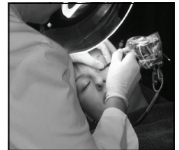
Permanent Color Technician

Continuing Education: To maintain licensure all permanent color technicians and tattoo artists must have: