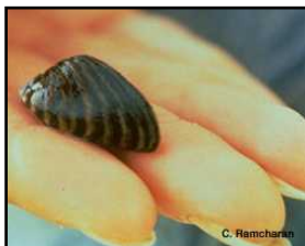
Zebra mussel