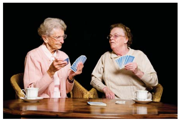
Find a variety of challenges that you enjoy and regularly engage your brain.

3. Feed and hydrate your brain: Our brains receive nutrition from two sources: oxygen (see number 5) and food (see