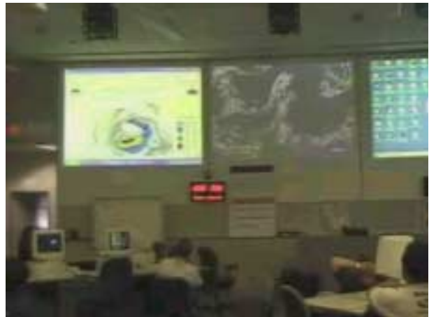
Figure 4. The SERFC's rain forecast is simultaneously being displayed on one of the large projection screens at the Florida Division of Emergency Management in Tallahassee, Florida.