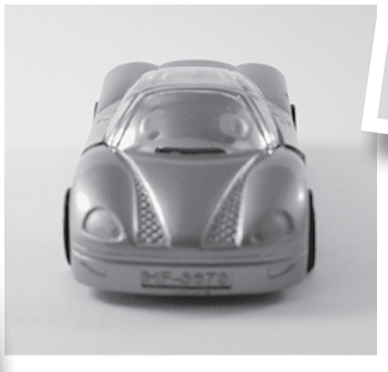
An array of novelty lighters that could be attractive to children.