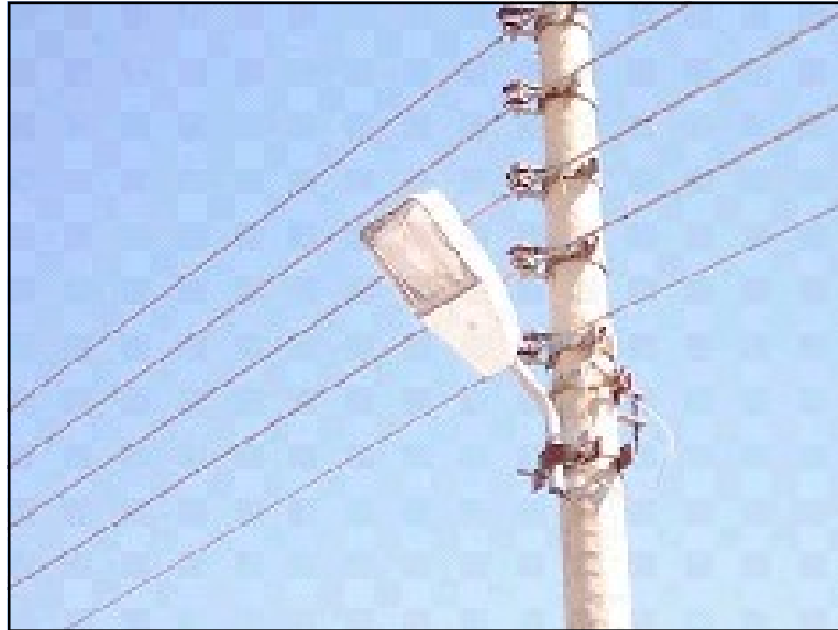
New electrical system installed by community members in Ninawa' Governorate

• Community members in a Ninawa' Governorate village have completed a project to install an electrical system in their neighborhood. This village has never had electricity, and community members identified the provision of this service as an immediate priority for the area. The project supplied the village with electrical cables, connectors, and transformers to connect the village with the main power system. This project was supported by USAID's Community Action Program and is benefiting approximately 2,500 individuals.