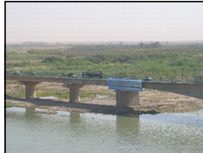
Tikrit Bridge after reconstruction