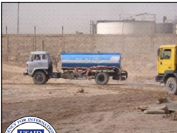
Truck wetting soil at the power plant site; dust was identified as a threat to worker's health during an environmental assessment conducted at this site