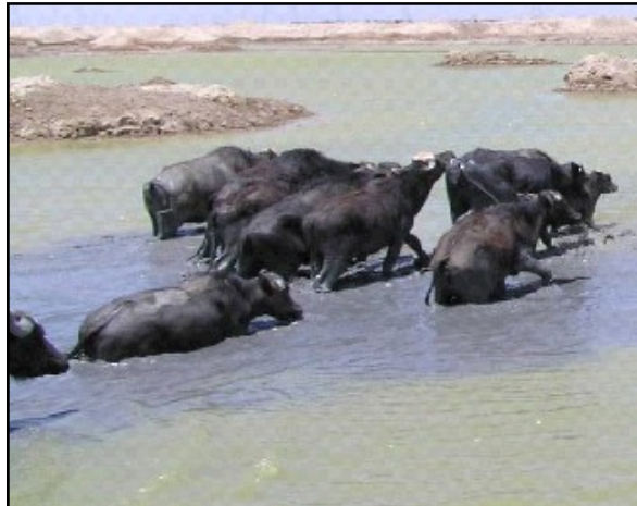
Buffalo supplied to families in Iraq's marshlands