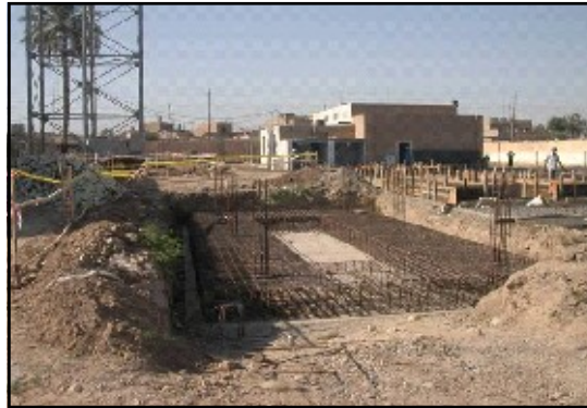
Foundation for water treatment plant alum and chlorine building