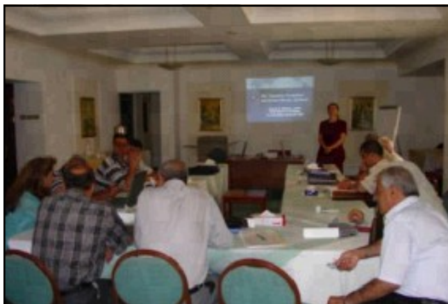
Workshop for Iraqi medical college professors on child nutrition

between this institute and the medical colleges. The conference addressed the child nutrition issues identified as most critical by the World Health Organization, including protein-energy malnutrition and deficiencies of vitamin A, iodine, iron and zinc. At the request of the participants, sessions on vitamin D, folic acid and selenium were also added to the program. Participants in the workshop brought data about the community health programs in Iraq and about research they had conducted during the past few years.