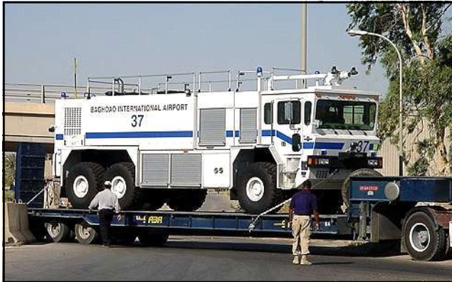
The Oshkosh TI-3000 fire truck. Three trucks were provided to Baghdad International Airport in July along with firefighting equipment including boots, helmets, work gloves, uniforms, and various tools. 83 firefighters also received extensive training on the TI-3000 and on firefighting techniques.

USAID's goal is to provide material and personnel for the repair of airport facilities, rehabilitate airport terminals, facilitate humanitarian and commercial flights, and assist the Iraqi Airport Commission Authority.