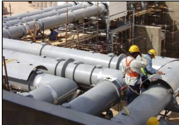
Iso-phase duct inspections at a USAID generation project in At' Tamim