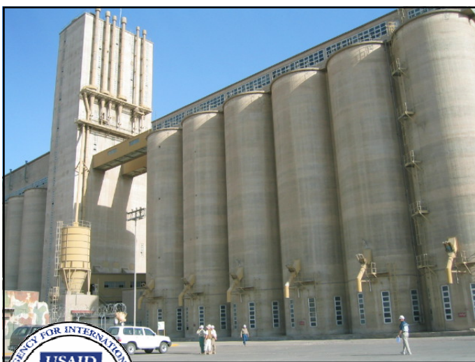
Grain silos at Umm Qasr port. In ruins after years of neglect and misuse, the grain-receiving facility at the port was rehabilitated by USAID in 2003 and is now fully operational and managed and maintained by staff of the Iraqi Grain Board. After major work was completed, USAID provided training in operations and maintenance, including hands-on experience in unloading the first grain shipment, which arrived November 14, 2003. As important components of Iraq's economic infrastructure, the Umm Qasr Seaport is a critical focal point for receiving goods, including humanitarian assistance.

USAID's goal was to rehabilitate and improve management at the port, manage port administration, coordinate transport from the seaport, and facilitate cargo-handling services such as warehousing, shipment tracking, and storage.