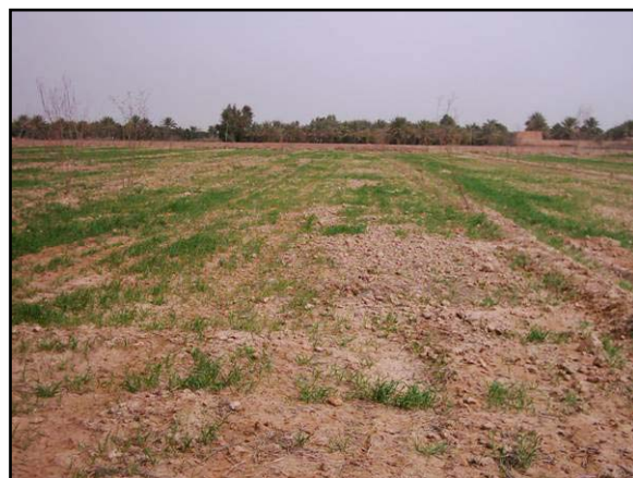
Crops planted using conventional farming methods.