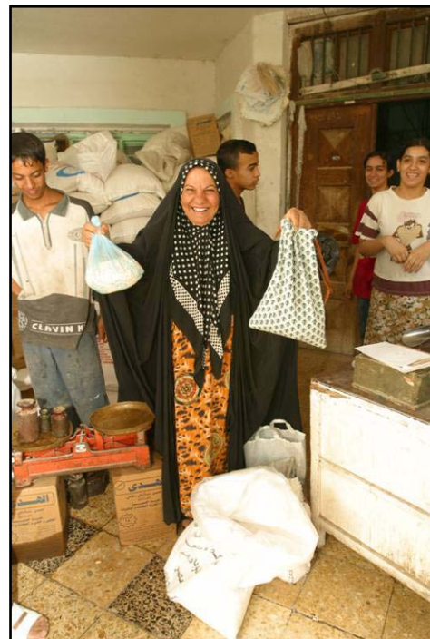
Ration distribution through Iraq's Public Distribution System

Food Security -- Objectives include: providing oversight support for the countrywide public distribution system, which provides basic food and non-food commodities to an estimated 25 million Iraqis; participating in the design of a monetary assistance program to replace the commodity-based distribution system to support local production and free-market infrastructure; and promoting comprehensive agriculture reform to optimize private participation in production and wholesale markets.