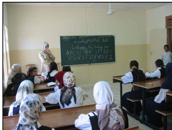
Girls studying in newly rehabilitated Rafah Secondary School for Girls.