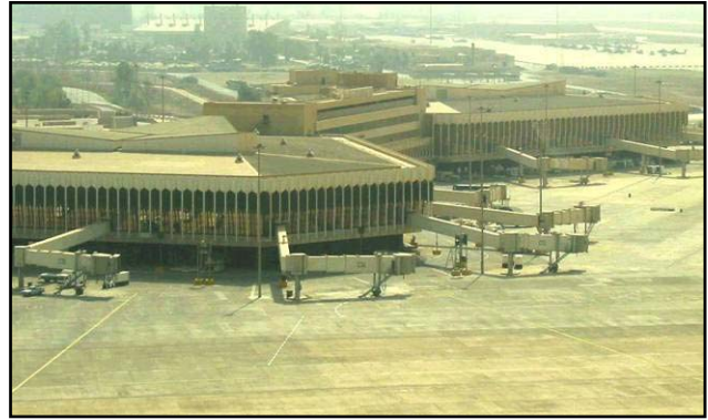
Baghdad International Airport Terminal was rehabilitated with support from USAID.

Bridges and Railroads -- Objectives include: rehabilitating and repairing damaged transportation systems, especially the most economically critical networks.