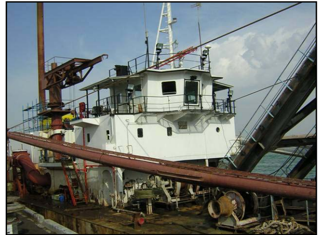
The Saif Saad Dredger after rehabilitation by USAID.

Telecommunications -- Objectives include: installing switches to restore service to 240,000 telephone lines in Baghdad area; repairing the nation's fiber optic network from north of Mosul through Baghdad and Nasiriyah to Umm Qasr.