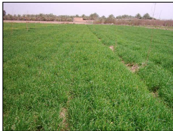
Crops planted using new technologies recommended by the Crop Technology Demonstration Program.

Marshlands – Objectives include: construct environmental, social and economic baselines for the remaining and former marshlands; assist marsh dwellers by creating economic opportunities and viable social institutions; improve the management of marshlands and expand restoration activities