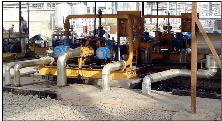
Al Qudas power plant. crude oil transfer pump.

Airports -- Objectives include: providing material and personnel for the timely repair of damaged airport facilities, rehabilitating airport terminals; facilitating humanitarian and commercial flights, and preparing the eventual handover of airport operations to the Iraqi Airport Commission Authority.