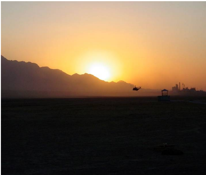
"Sunset on the Firing Line" German Special Forces (ISAF) CH-53 conducts twilight door gunner CAS training on Camp Shaheen Weapons Range Facility

MG Durbin and BG Pritt of the US Army along with BG Smith came to Camp Spann to validate Corps OMLTS. COL Kuhl from the German Army assumed Corps Senior OMLT Mentor duty on 18 September 2006. LTG Eikenberry also visited the 209 th Corps. The visit was centered around checking on the welfare of ANA troops and Coalition Forces. Last but not least RADM Tomlin from NAVELSG flew from the US to visit the Navy Embedded Trainers and evaluate their integration into the RCAG.