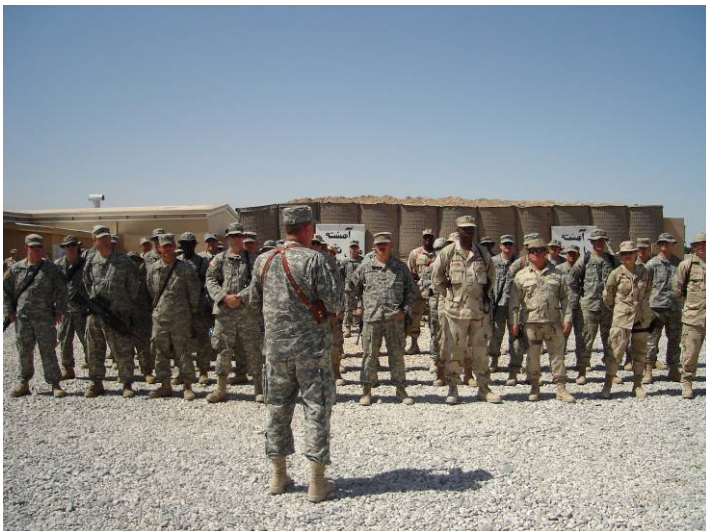
CSM forms up the US troops to honor the brave men and women who lost their lives 11 September 2001.