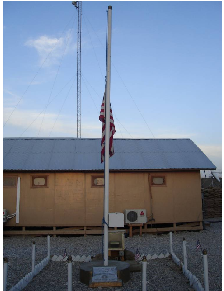
ODA says goodbye to one of their own in an informal ceremony 12 October 2006.