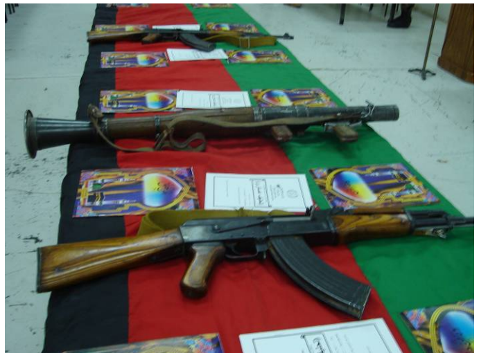
Ceremonial Weapons and Koran