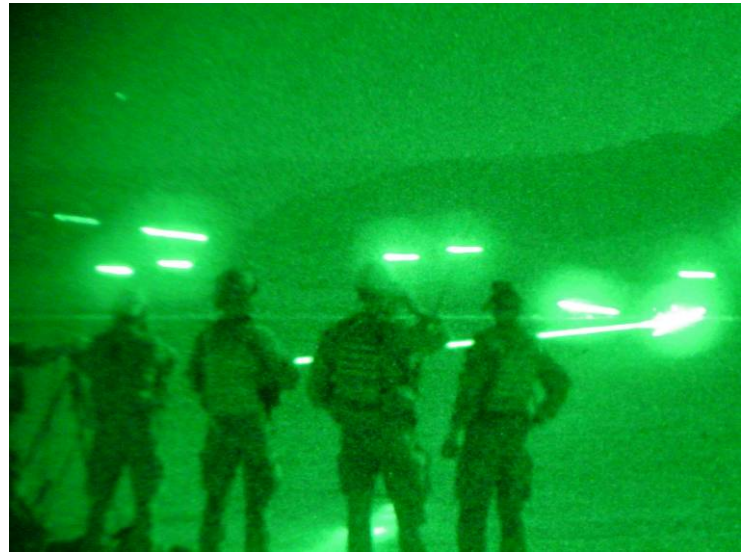
"Night Vision Fireworks" German Special Forces (ISAF) IR laser designate targets for CH-53 door gunner CAS training on Camp Shaheen Weapons Range Facility

The Camp Shaheen Weapons Facility has earned a reputation amongst the ISAF and ANA communities as a top notch weapons training site with the capability of handling multiple live fire events simultaneously. The range has hosted over 54 live fire events and over 2200 personnel in the past 2 months including, mortars, artillery, armored tracked vehicles, snipers, and several MTTs from KMTC. Additional planned improvements such as permanent firing positions for the D30 howitzer, MOUT, and Combat Engineering Lanes will bring new training capabilities enabling the 209th RCAG to lead the way with practical, salient, and robust live weapons training for the ANA, ANP and their partners.