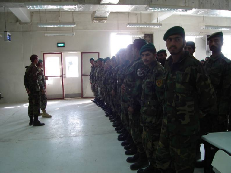
ANA soldiers stand in formation prior to ceremony.