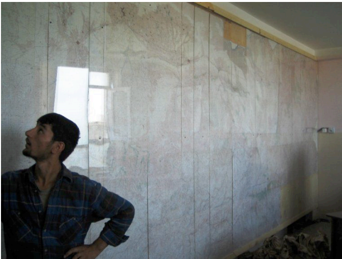
Assessing the finished product at the Mazar-E-Sharif ANP local headquarters.

The 3-5 th Kandak has started what many hope will become a tradition on Thursday nights. For the last three Thursday's they have had cook outs, played cards, and listened to some tunes with all their peers. They have extended the invitation to all. Many from the camp have joined in the fun and food.