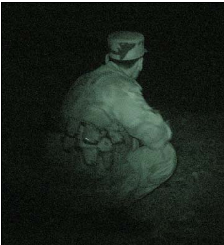
ANA soldier providing security on the night patrol.

Situated just outside of Kabul Afghanistan and inside the Afghanistan National Army (ANA) Kabul Military Training Center (KMTC) is a place called Camp Alamo. Now three months into their yearlong deployment, 2nd Platoon, Charlie Company, 1-180th Infantry calls it home. With a platoon size of