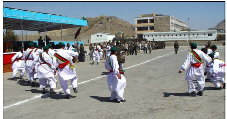
Graduates celebrate by performing the Man Dance at the conclusion of the ceremony

mately 1200 soldiers is the 53rd to complete basic training at KMTC since the formation of the ANA and the opening of the facility in 2002. KMTC is the national training center for incoming ANA soldiers and conducts