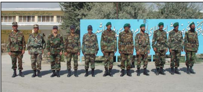
Honor graduates from Kandak 53