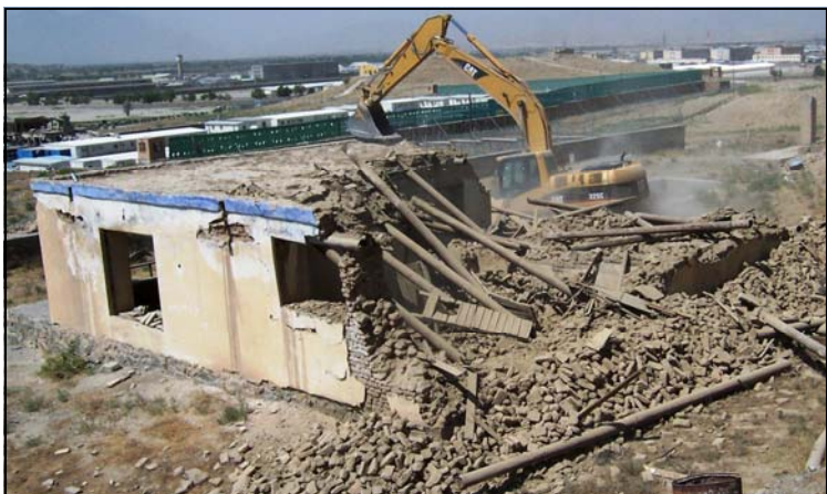
Destroying an abandon building to eliminate any possible military threat.

I look forward to telling you what your soldiers are doing here and updating you on our success. Please continue to pray for all of us in the Training Assistance Group and don't forget to add in our Coalition partners. We miss you and think of you often. Thank you for supporting us.