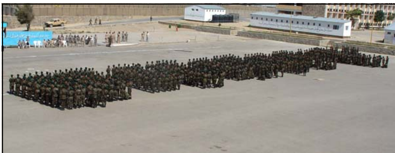
Kandak 53 in formation for Graduation

basic training, advanced individual training (AIT), drill sergeant school and officer training.