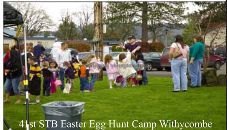
41st STB Easter Egg Hunt Camp Withycombe

We have some exciting things coming up, such as: Deployment information briefings, Swim day at the Recreation Centers, Mom's night out at Pappa's pizza, and we are trying to once again have military days at the local county fairs. All dates are to be announced. If you have not yet received a personal phone call from a family program volunteer within the 82 CAV it is essential that you let me know. It is extremely important to me that each family has personal contact with a volunteer. Please don't hesitate to call me with any questions or concerns!!!