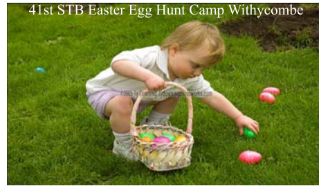
41st STB Easter Egg Hunt Camp Withycombe

We are planning activities for families to attend at Kliever throughout the deployment. These events will allow you to gather with others sharing your deployment experience. We hope to liven up these gatherings with demonstrations such as scrap-booking or rubber stamping. We welcome ideas for our gatherings. We also welcome the opportunity to meet with you at Kliever in our freshly painted and cozy Family Program Room, located just to the right of the main lobby as you enter the building.