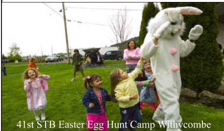
41st STB Easter Egg Hunt Camp Withycombe