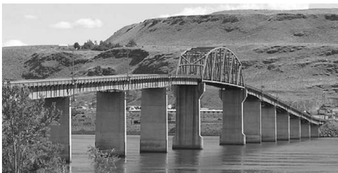
US97 Columbia River Biggs Rapids - Sam Hill Bridge

The Washington State Department of Transportation still plans to complete Stage 1 of bridge deck replacement work and reopen the Biggs Rapids-Sam Hill Bridge over the Columbia River before Memorial Day, May 26. But Stage 2 of the work requires closing the bridge again after Labor Day, September 1, until work is completed several months later. The bridge will be open to traffic just during the period from Memorial Day to Labor Day. Completion of the Stage 1 work has allowed for lifting special weight restrictions that had been in effect for this bridge since 2001. It is now restricted to divisible load limits (no heavy haul loads).