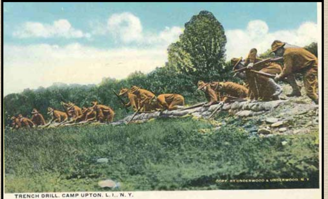
Postcards sent from Camp Upton soldiers to their families

Remnants of the World War I training trenches are still visible around the BNL site and are some of only a few surviving WWI earthwork features in US.