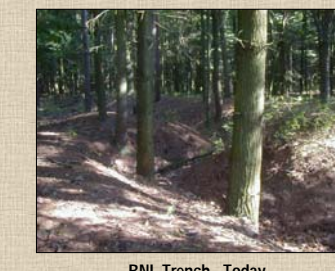
BNL Trench - Today