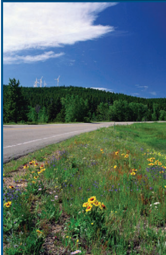
Wearen Gretz, NREL/PX00280