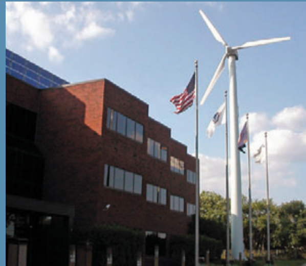
Powering our communities and businesses