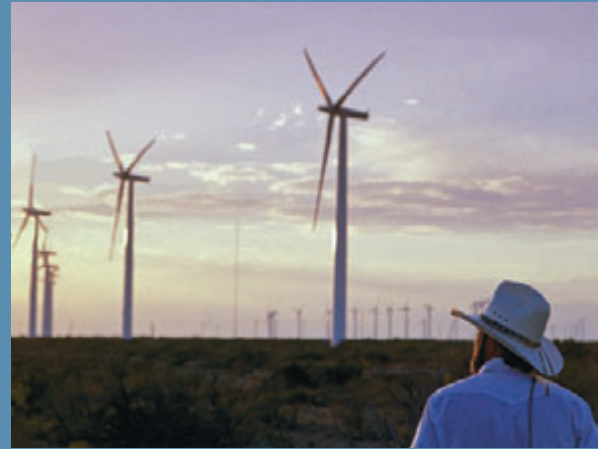
Strengthening rural economies