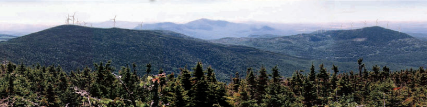
Securing a clean energy future