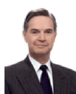
Luis Ernesto Derbez Secretary of the Economy Mexico