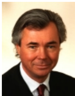
Pierre S. Pettigrew Minister for International Trade Canada