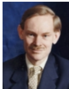
Robert B. Zoellick United States Trade Representative United States