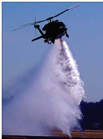
Firehawk Water Drop

The Sisters unit was involved with two large fires that both started in the Mt Washington Wilderness area. The Black Crater fire which started on July 24th, started in the wilderness area approximately two miles from private lands. The Unit was involved with suppression efforts beginning at initial attack. Due to extreme conditions the fire burned onto private lands and caused the evacuation of several subdivisions in the area. Although the fire did not burn into the subdivisions, private lands were involved totaling 4,252 acres. The second fire started on August 7th; Lake George fire origin was again in the wilderness located at the base of Mt Washington. The unit again was involved from the beginning supplying crews, engines, and dozer 91 to assist the Forest Service with suppression. The Lake George fire was within two miles of private lands. A type I team was called in to take over both the Lake George fire and Black Crater, which was in the mop-up stage. Due to some very aggressive initial and extended attack from local resources, along with mutual aid, the Lake George fire was kept inside the wilderness area and did not burn on to private lands.