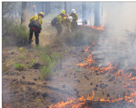
2006 Fire Training

Just as the Maxwell and Black Rock fires were winding down, the next significant lightning event passed over the unit. This event, lasting for three or so days sparked over 70 fires on the unit. If it wasn't for the hard work of the initial attack crews, copious amounts of move-up resources, and the rain that accompanied all but the initial day of this storm, the unit would have had numerous project fires, but in the end, only one project fire emerged. The Two Cabin Complex located around Monument, consisted of eight fires ranging in size from ¼ acre to 287 acres for a total of 800 + acres. ODF Team 3 managed this complex for several days until the unit workload slowed enough to turn it back to the unit.