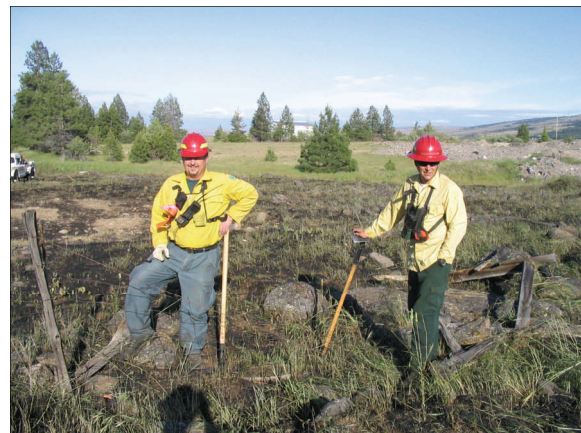
Kelly Spring Fire

Two fires accounted for 95% of acres burned on the unit. These two fires occurred two days apart in late October, both of which were caused by hunters. ODF had very little staffing left at the time and utilized mutual aid with Federal cooperators and local Fire Departments.