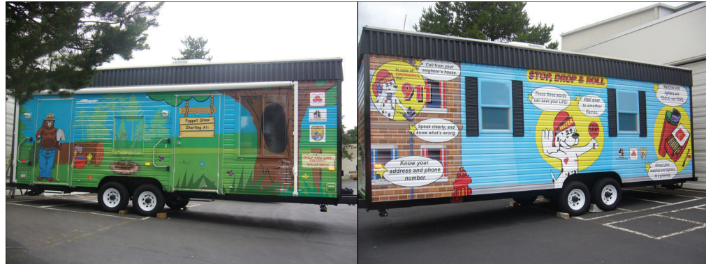
The New Central Oregon Fire Prevention Cooperative Fire Prevention Trailer Purchased with a State Farm Insurance grant and National Fire Plan Grant funding

The Central Oregon District is one of the most highly populated wildland urban-interface areas within the state of Oregon. Deschutes County alone has grown over 60% in the last ten years. Because of the rapidly growing number of residents and recreationists and the highly diverse topography and fuel types, district employees have developed and adopted many innovative fire prevention programs and with constant evaluation these programs have proven their worth.