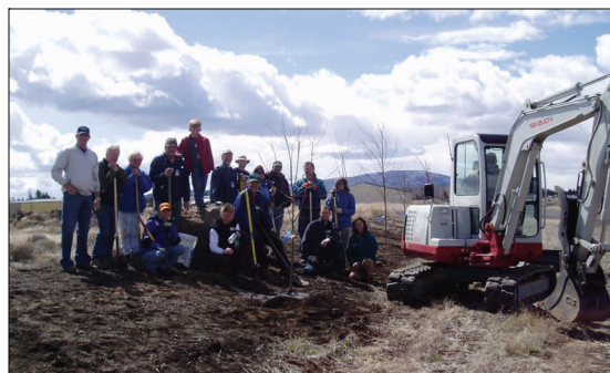
Prineville's Arbor Week Tree Planting

Gilliam County can boast having a Certified Arborist on staff, thanks to receiving an exam scholarship from the International Society of Arboriculture and the USDA Forest Service. The ODF U&CFA Program loaned educational materials to the recipient of the scholarship and is now working with him to "pay back" for the scholarship by assisting the three incorporated cities within the county – Arlington, Condon and Lonerock - with arboriculture issues.