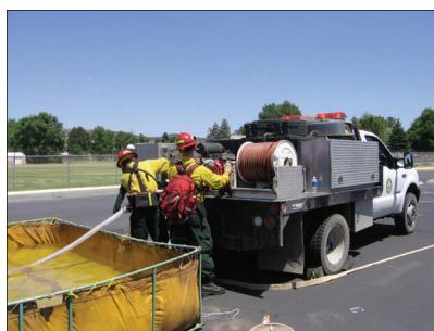
2007 - Water Handling

Initial attack readiness for each fire season is critical to meet the mission of the department "keep 94% of all fires under 10 acres."