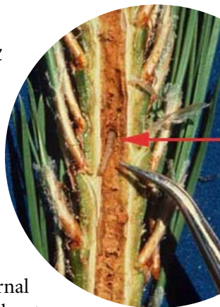
Figure 1: During June and July western pine shoot borer larvae feed in the pith area of pine terminals.

Western pine shoot borer infestations can usually be diagnosed by examining the morphology of the current terminal. External symptoms of shoot borer infestations include shortened needles at the top of the terminal and reduced elongation of the shoot. The shortened needles give the terminal a clubbed appearance (Figure 3A). Because the infested terminal does not fully elongate, lateral shoots are often longer than the infested terminal. A normal (uninfested) terminal shoot is usually 25-40% longer than lateral shoots on the same tree (Figure 3B). Another external sign of shoot borer infestation is an exit