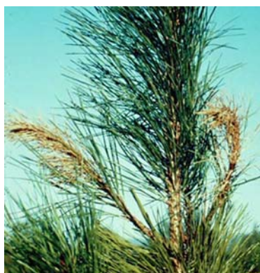
Figure 2: Dead lateral shoots in the upper whorl of a ponderosa pine as a result of shoot borer infestation.

The western pine shoot borer is a moth larva feeding in the pith tissue of new terminal or lateral shoots (Figure 1). Tree damage is common in young pine plantations located in eastern and southwestern Oregon. Infested terminal shoots are usually stunted, but survive, while infested lateral shoots usually die (Figure 2). Each attack on the terminal shoot reduces annual height growth by 25% and sometimes damages tree form. Tree genetics affects susceptibility to shoot borer attack and can confound growth data collected at pine progeny test sites.