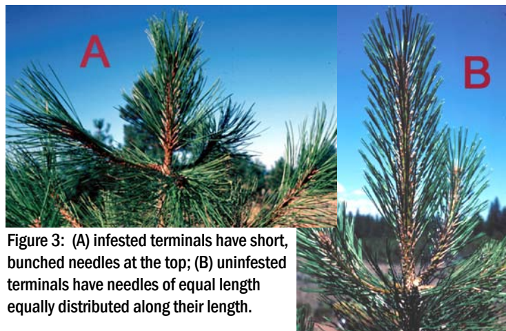
Figure 3: (A) infested terminals have short, bunched needles at the top; (B) uninfested terminals have needles of equal length equally distributed along their length.

The symptoms of shoot borer attacks in lodgepole pine are similar to those in ponderosa pine, but less obvious at a distance. Larval feeding is more destructive in the small diameter