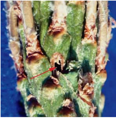
Figure 4: After August an emergence hole can be located in the lower half of the pine terminal.

lodgepole terminals and emergence holes can weaken the stem, resulting in breakage. Frequently the tip of infested lodgepole pine terminals will die by late fall. Laterals often compete with infested terminals for dominance, but the effects on tree form are usually minor. The annual reduction in height growth from