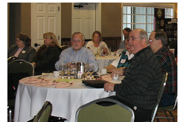
Fire professionals and property insurers take in the Insurance Wildfire Summit held on Nov. 14, 2006 in Cottage Grove.

The insurance industry is a key partner with these agencies in helping residents reduce their vulnerability to wildfire.