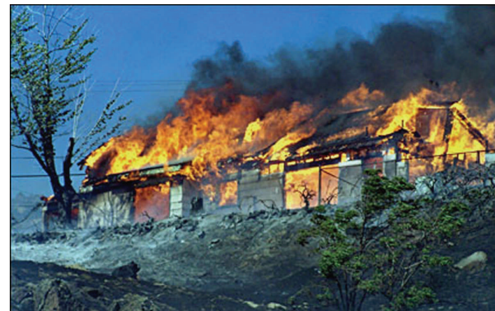
This wildfire near the town of Arlington in spring 2006 spread rapidly. The destructive blaze exemplifies the rise of human-caused fires in Oregon's wildland-urban interface.

At the four Insurance Wildfire Summits held around the state in 2006, fire experts described in blunt terms the threat posed by wildfire to residents of Oregon's wildland-urban interface.