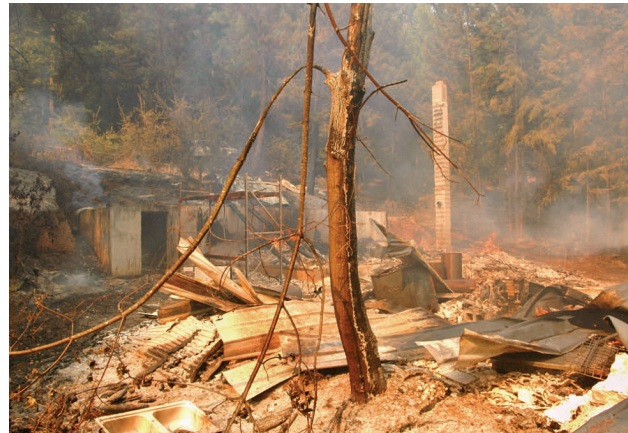
Scenes like this will become rare as more and more homeowners make their property survivable against wildfire. (Deer Creek Fire, southwestern Oregon, 2005)

The cornerstone of the efforts to protect the interface is The Oregon Forestland Urban Interface Protection Act. Passed by the Oregon Legislature in 1997, Senate Bill 360 (as the act is commonly known) enjoyed strong support from the timber industry and the structural fire service. In legislative hearings, the insurance industry took an active role in helping shape key portions of the bill.