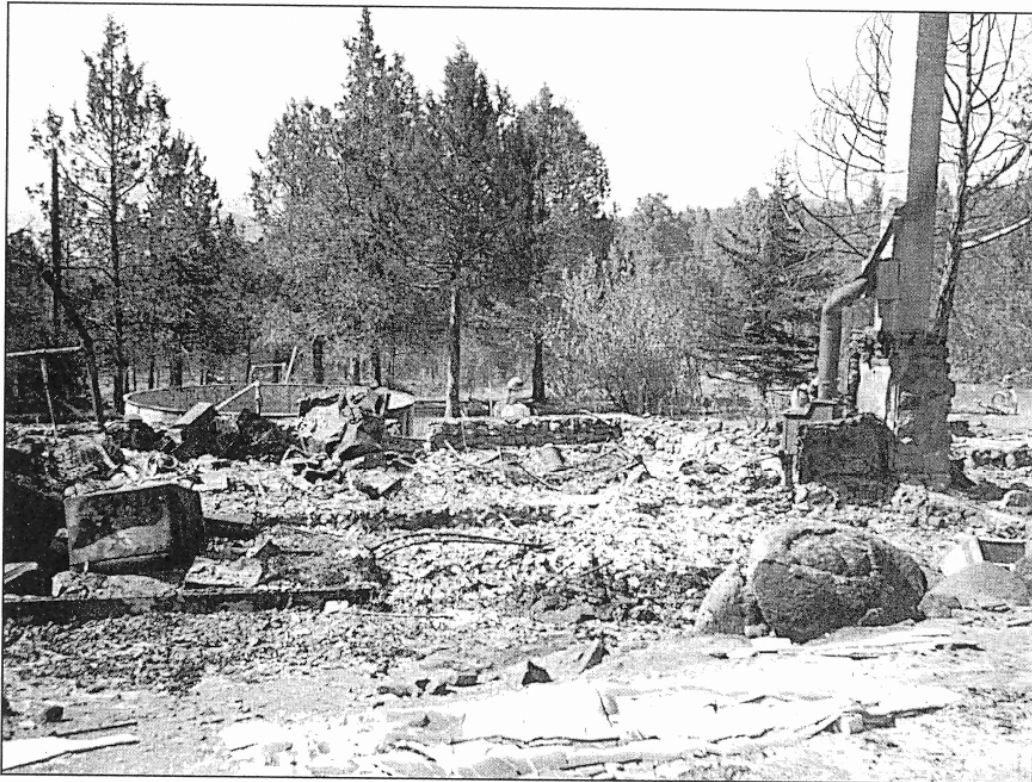
Forest land homes that are poorly sited are vulnerable to wildfire.

Fire also burns hotter as the amount of available fuels increase. Such fuels as heavy brush and logging slash can burn with incredible intensity. Therefore, consistent with the guidance above, dwellings, where possible should be