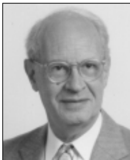
Gerhard L. Weinberg