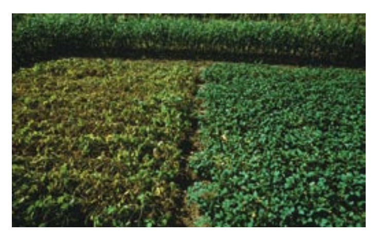
Symptoms in non-tolerant (left) and tolerant (right) soybean infected with soybean rust.

Seedborne transmission of the disease has not been documented, but there is some concern that seed lots may contain small amounts of infected plant debris capable of spreading the pathogen. To date, seed lots have not proven to be a pathway for the disease. Clouds of spores are released if infected plants are disturbed by wind or by individuals walking through rust-infected areas. Individuals who are sampling for soybean rust may transport spores from one area to