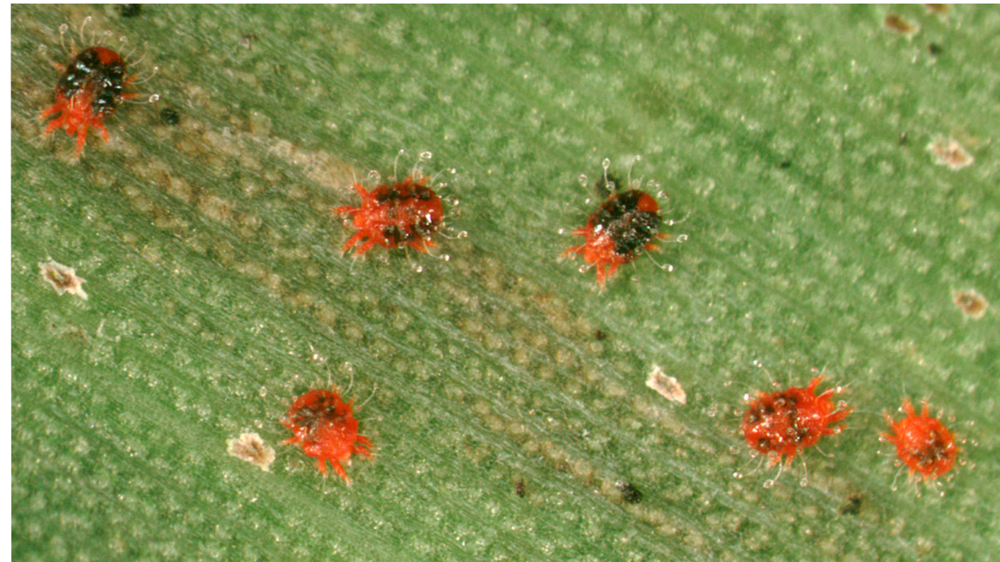
Figure 1—Nymphs and adults of red palm mite, Raoiella indica , on a coconut leaf.

Primary hosts for the RPM are members of the palm family, including coconut and date palms, plus several ornamental palms such as the queen, princess, Christmas, fan, and Canary Island palms. In addition, banana and plantain plants in the Caribbean have suffered significant damage from the feeding of