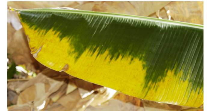
Figure 4—Banana leaf with characteristic yellowing pattern caused by the feeding of RPMs. Photo by Farzan Hosein (Ministry of Agriculture, Land and Marine Resources, Trinidad and Tobago) and reproduced by permission.

Please report any suspected damage from RPM or provide mite specimens to your State department of agriculture, extension agent, or the Plant Protection and Quarantine office of the U.S. Department of Agriculture's (USDA) Animal and Plant Health Inspection Service (APHIS) in your area. Look for a local USDA-APHIS phone number in the blue pages of your telephone book. Or visit this Web site: http://www.aphis.usda.gov/plant_health/plant_pest_info/red_palm_mite/index.shtml for more information about the RPM.