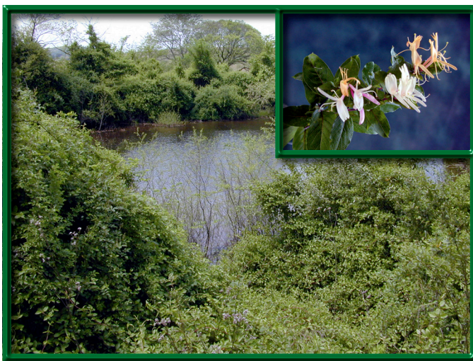
Japanese honeysuckle occurs in early to mid-successional habitats. It kills young trees by twisting tightly around the trunks, cutting off the flow of water through the plant.

Often introduced as ornamental plants in gardens or planted for erosion control, invasive plants have escaped into the wild where they flourish. Invasive plants tend to be most problematic in disturbed areas such as clearings and openings along roads, under transmission lines, beside waterfronts, and in areas with dead pines. Some can, however, grow on more natural sites. Kudzu ( Pueraria montana ) invades areas of the ORR along roads and transmission lines, but it is seldom found in adjacent, more natural habitats. In contrast, Japanese grass ( Microstegium vimineum ) grows not only in disturbed areas, but also spreads rapidly in forests otherwise unchanged for decades.