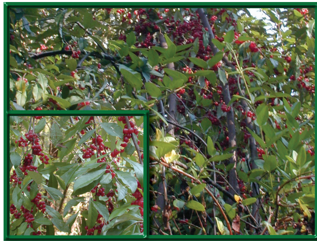
Autumn olive is mostly a problem along rights of way on the ORR. It generally requires disturbance and ample sunlight for establishment and growth, but is drought tolerant. Birds and mammals eat the fruits and spread the seeds far and wide.