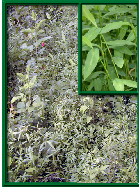
Japanese grass forms dense patches and displaces native vegetation as it spreads. Its control involves labor-intensive hand pulling or multiple applications of herbicide.

Not all green is good. Almost 170 species of nonnative plants grow on the Department of Energy's (DOE's) Oak Ridge Reservation (ORR). Many of these unwelcome plants have no natural controls in this area and compete with native vegetation. They are, thus, invasive and harmful to native biodiversity. President Bill Clinton signed Executive Order (EO) 13112 in 1999 to address the problem of invasive species in the United States. That EO requires federal agencies such as DOE to help prevent the introduction of invasive species and to control them when they occur.