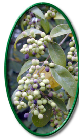
Chinese privet is most abundant on the ORR in disturbed areas. It produces copious quantities of fruits and seeds, enabling it to spread quickly.

Some invasive plants grow in dense patches that smother and exclude native plants. Such patches on the ORR contain kudzu, Japanese honeysuckle ( Lonicera japonica ), Chinese privet, multiflora rose, sericea lespedeza, periwinkle ( Vinca minor ), autumn olive, and bull thistle ( Cirsium vulgare ).