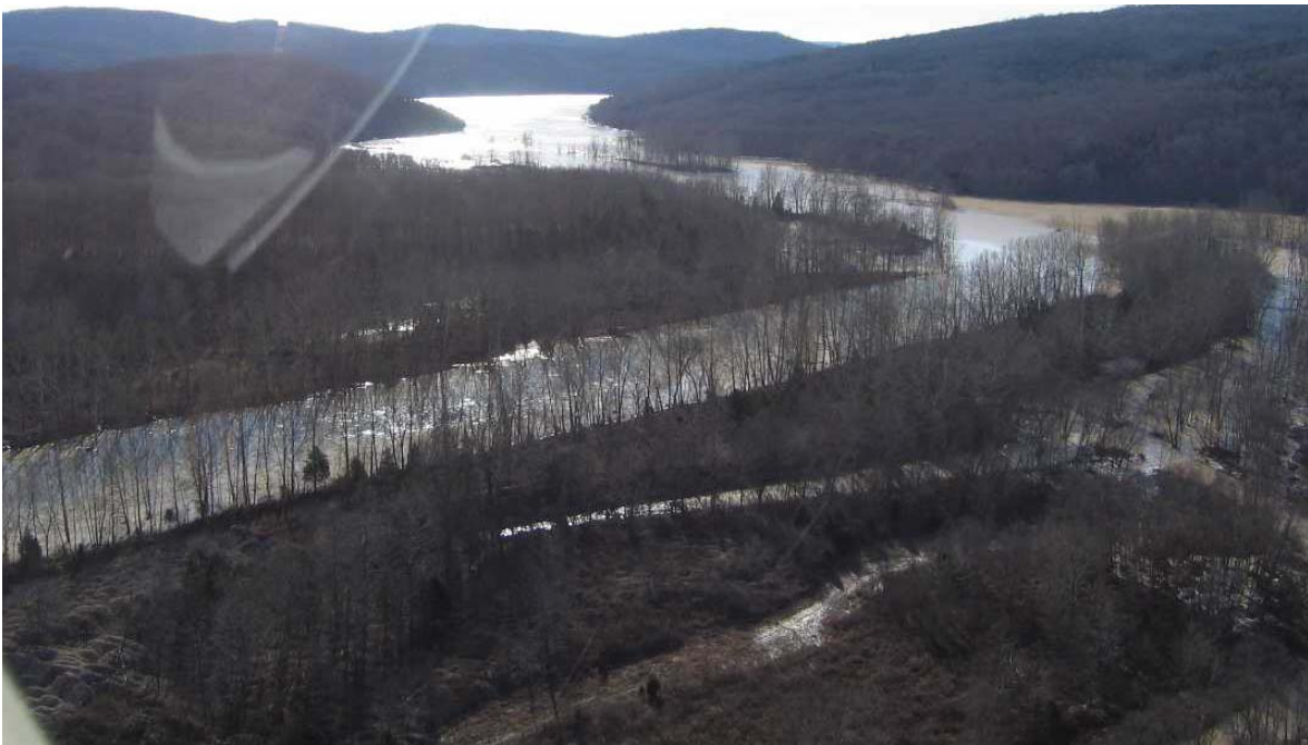
Figure 11.15 - East Fork Black River leading into Taum Sauk lower reservoir. December 2005.

According to the MDC, there are approximately 15 amphibian species and 18 reptilian species in the forested and aquatic areas of the project. The species include: seven frog and one toad species; six salamander species and the red-river mudpuppy; 12 snake species such as the copperhead, black rat, eastern garter, kingsnake, and timber rattlesnake; four turtle species; and two skink species (MDC, 2005).