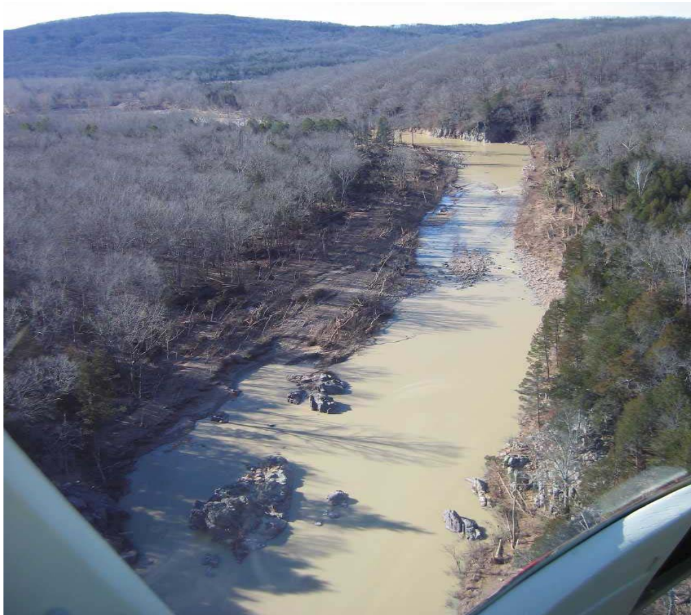
Figure 11.9 - Scour and loss of riparian habitat below the Shut-Ins.

For natural fish reproduction in streams, the channel generally consists of a series of pools, chutes and riffles. Inspection of the stream channel within the state park to the Shut-Ins area indicated substantial alteration of the natural stream channel thereby creating the loss of habitat as well as food sources.