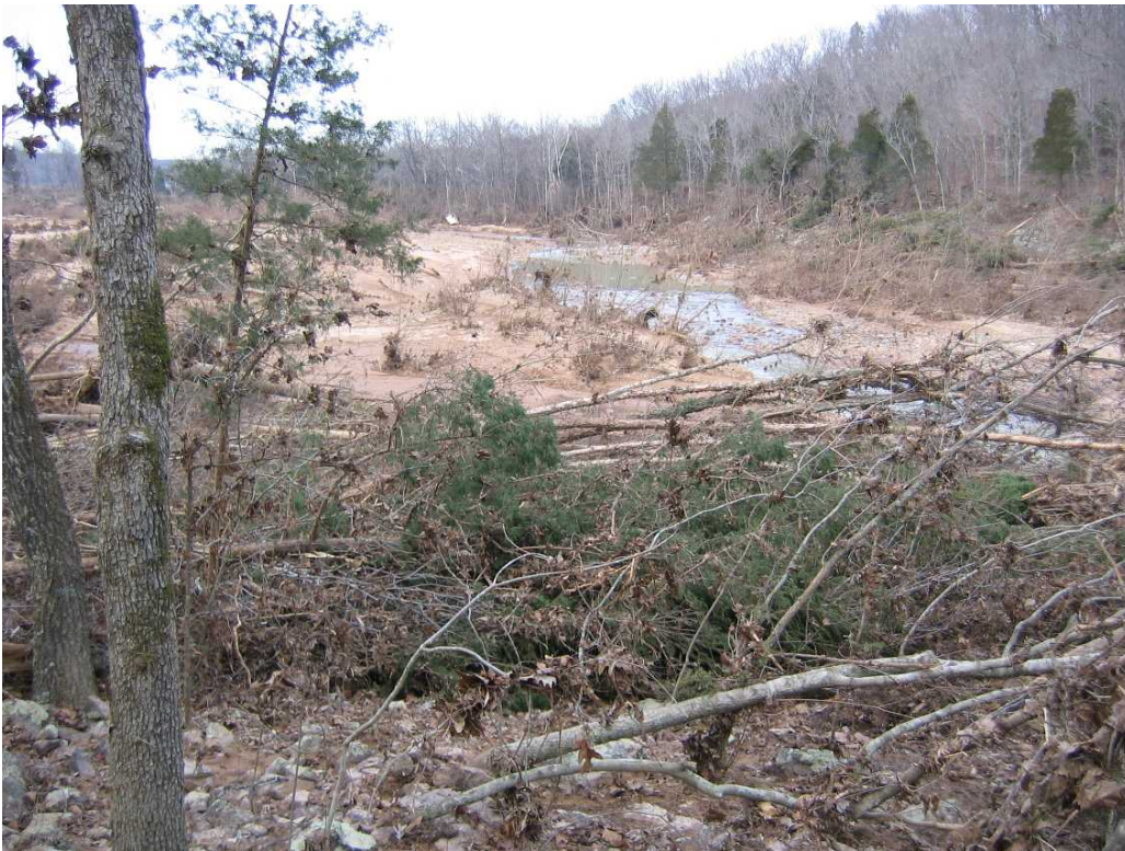
Figure 11.8 - East Fork Black River within State Park.