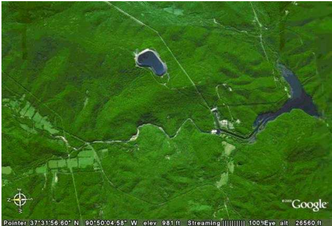
Figure 11.13 - Pre-event satellite photograph of the forested area surrounding Proffit Mountain.

problematic. It is expected that due to the absence of topsoil, this area will remain deforested.