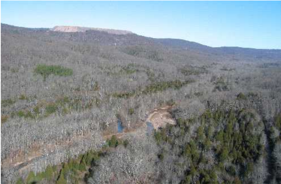
Figure 11.10 - Forested area surrounding Proffit Mountain (opposite side of breach) with upper reservoir in the background. December 2005.

found in this area; however in the southern and southeastern Ozarks, shortleaf pine may comprise 25 to 50 percent of the stand. The MDC adds that the remaining trees in this upland area are dominated primarily by oaks such as white, black, scarlet, and northern red oak and the less common species include southern red, chinkapin, burr, and pin oak. Hickory makes up a small percentage, but is a consistent part of the forest. Other important large tree species include blackgum, red and sugar maple, ash, elm, black walnut, and red cedar. Also, there are many small tree species associated with oak-hickory forests. These include dogwood, sassafras, redbud, serviceberry, eastern hop hornbeam, and American hornbeam (MDC, 2001).