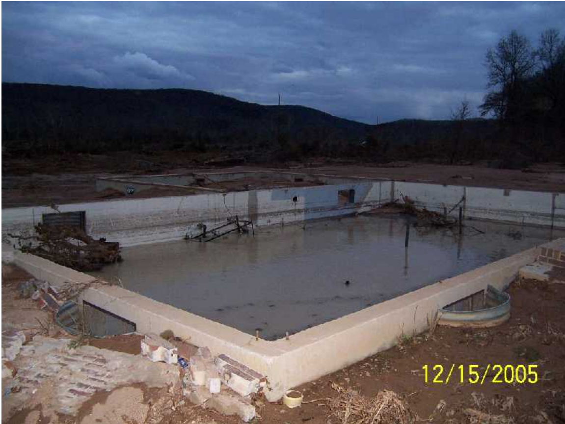
Figure 11.1 - State park superintendent's former home.

(Compiled from news sources, Dec. 14 2005). Eventually, after varying weeks of hospitalization for the children, they were all released from the hospital in good health.