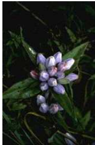
Figure 11.12 - Closed Gentian ( Gentiana andrewsii )