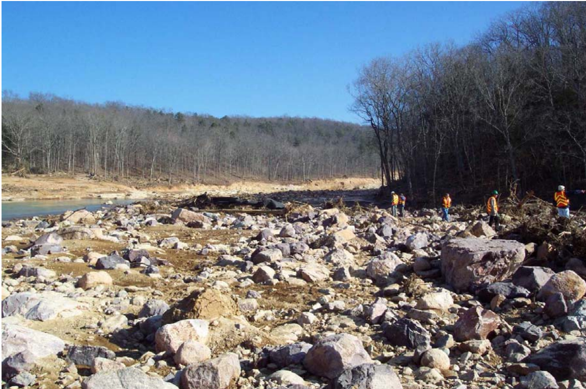
Figure 11.4 – Looking upstream from debris dam

sections of the geomembrane lining from the Upper reservoir were also present in the debris field.