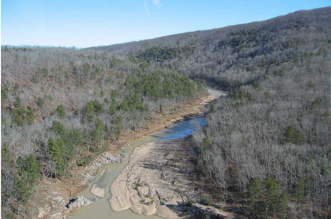
Figure 11.14 - Deforested riparian vegetation below Shut-Ins area of state park.

The riparian vegetation along the East Fork Black River was another area that suffered substantial deforestation (Figures 11.1-11.5). The extent of the damage is severe and extends from the entrance to the state park through the Shut-Ins area and below the Shut-Ins area to the lower reservoir. In some areas over one hundred yards of riparian vegetation was washed out due to the breach. In other areas ground-covering riparian vegetation was buried in silt and sand limiting recruitment. Natural recovery of the riparian areas will be hampered by poor soil quality and lack of soil (bedrock exposure) due to the flood.