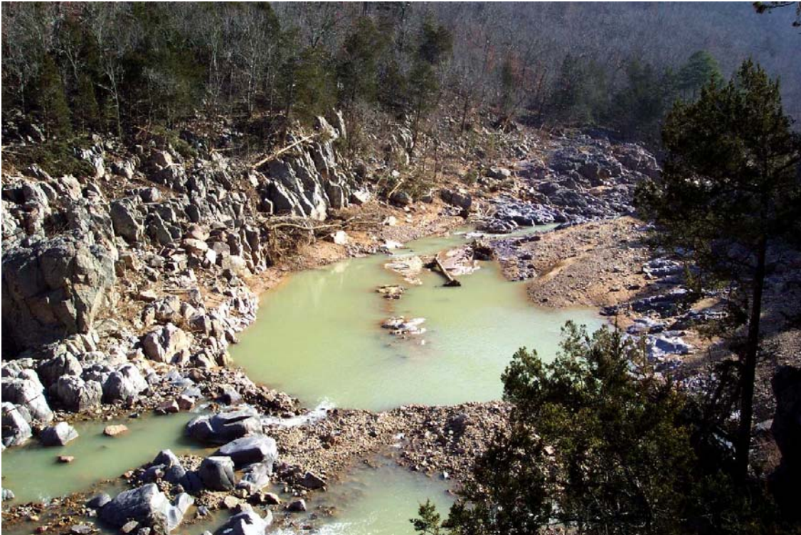
Figure 11.5 – Turbidity at Johnson’s Shut-ins

the particles and allow them to settle. Flocculation is a process by which the electrostatic charge of suspended particles is neutralized by a flocculent, allowing the particles to stick to one another and form flocs. Once the flocs are large enough they fall from suspension. After receiving state approval of the plan on January 20, 2006, and Commission approval on January 25, 2006, the licensee applied the flocculent to the lower reservoir on January 25-27, 2006. Without use of a flocculent the particles would have stayed in suspension, and the water in the lower reservoir would have cleared much more slowly. In addition, turbidity caused by suspended clay particles would have remained in the river downstream over a longer period and likely extended further downstream.