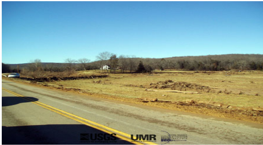
Figure 11.2 - Farmland with debris on north side of Route N. Note home on small hill.

One home approximately 200 hundred yards from the Superintendent's residence (located off Route N) was surrounded by flood waters but, because it is located on a small hill, the flood waters encircled the residence but did not flood it. The surrounding farmland however, was flooded and debris and sediment was deposited in the fields. Additionally, some of the farmland fencing was destroyed (Figure 11.2).