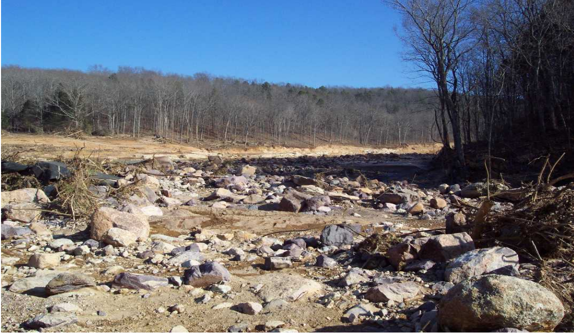
Figure 11.7 - Modified channel of the East Fork Black River