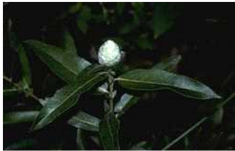
Figure 11.11 - Silky Willow ( Salix sericea )

The wetland areas at the state park consist of a seep forest and calcareous fen located within the floodplain of the East Fork Black River (MDC, 1999). According to the MDC, seep forests are rare in Missouri and are comprised of red maple, green ash, slippery elm and honey locust. Additionally, two rare plants are also found in the fens along with other notable wetland species including closed gentian, silky willow (Figure 11.11 and Figure 11.12) and an uncommon variety of southern blue flag (MDC, 1999).