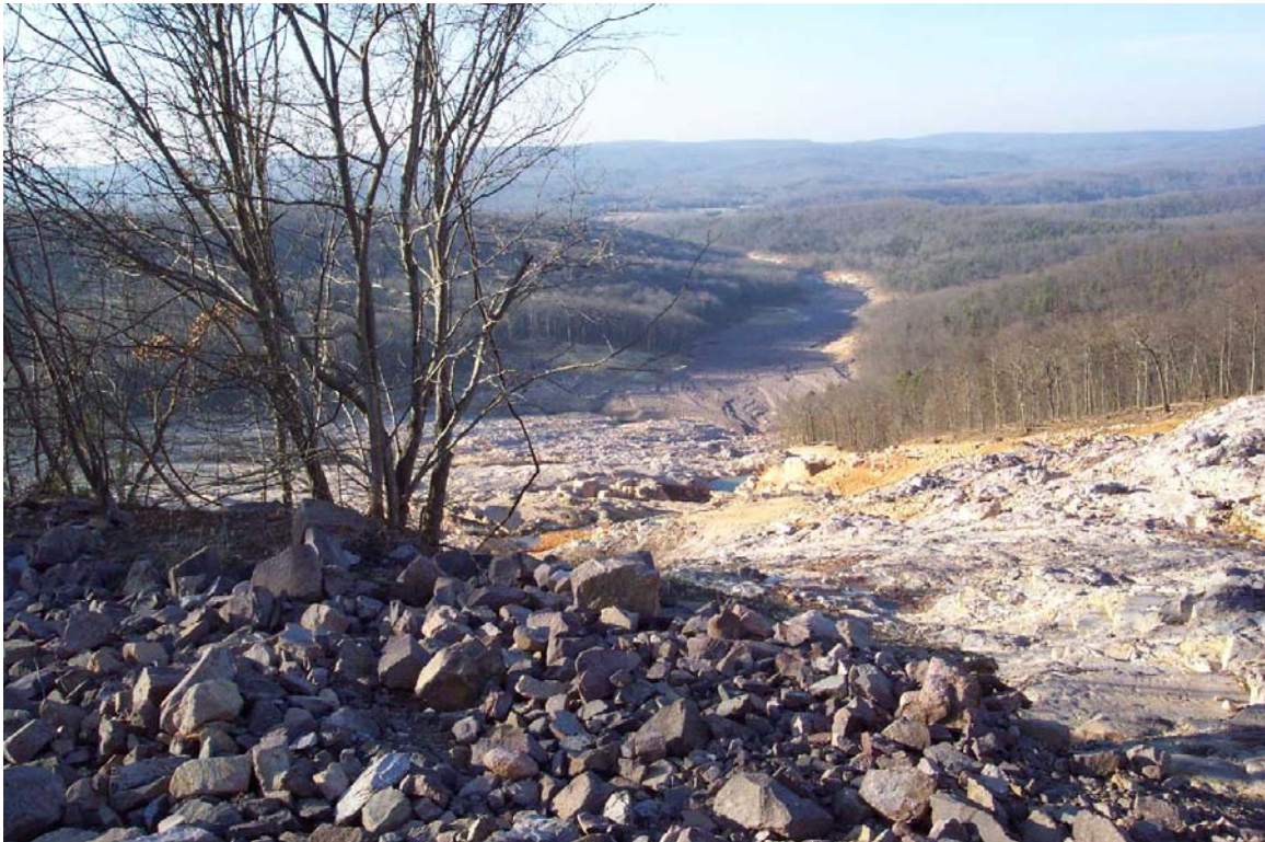
Figure 11.3– Downstream view from breach

Approximately 317 acres, between the upper and lower reservoir, were directly impacted by the release of water immediately following the dam breach. A map and description of the land uses and soils of this impacted area can be found in Appendix E in the back of this report. The erosive force of the water from the breach removed all topsoil to bedrock in an approximate 200-yard swath, down the face of the Proffit Mountain (Figure 11.3) along the course of an intermittent unnamed tributary. Also, seen in Figure 11.3 is the shallowness of the topsoil along the tree line.