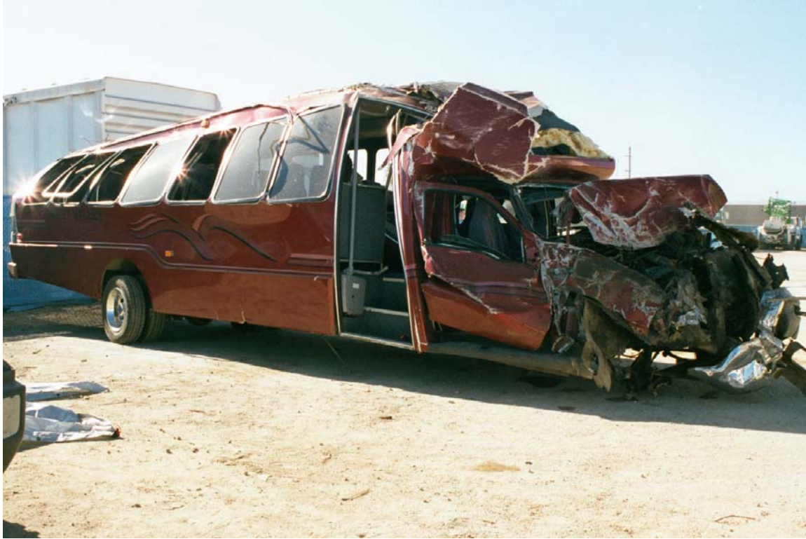
Figure 2. Body damage to nonconforming bus involved in San Miguel accident.

For its 1999 special investigation of nonconforming buses, 3 the Safety Board investigated four accidents. Nine people were killed and 36 were injured in these collisions. Most of the victims, including the eight fatalities, were children.