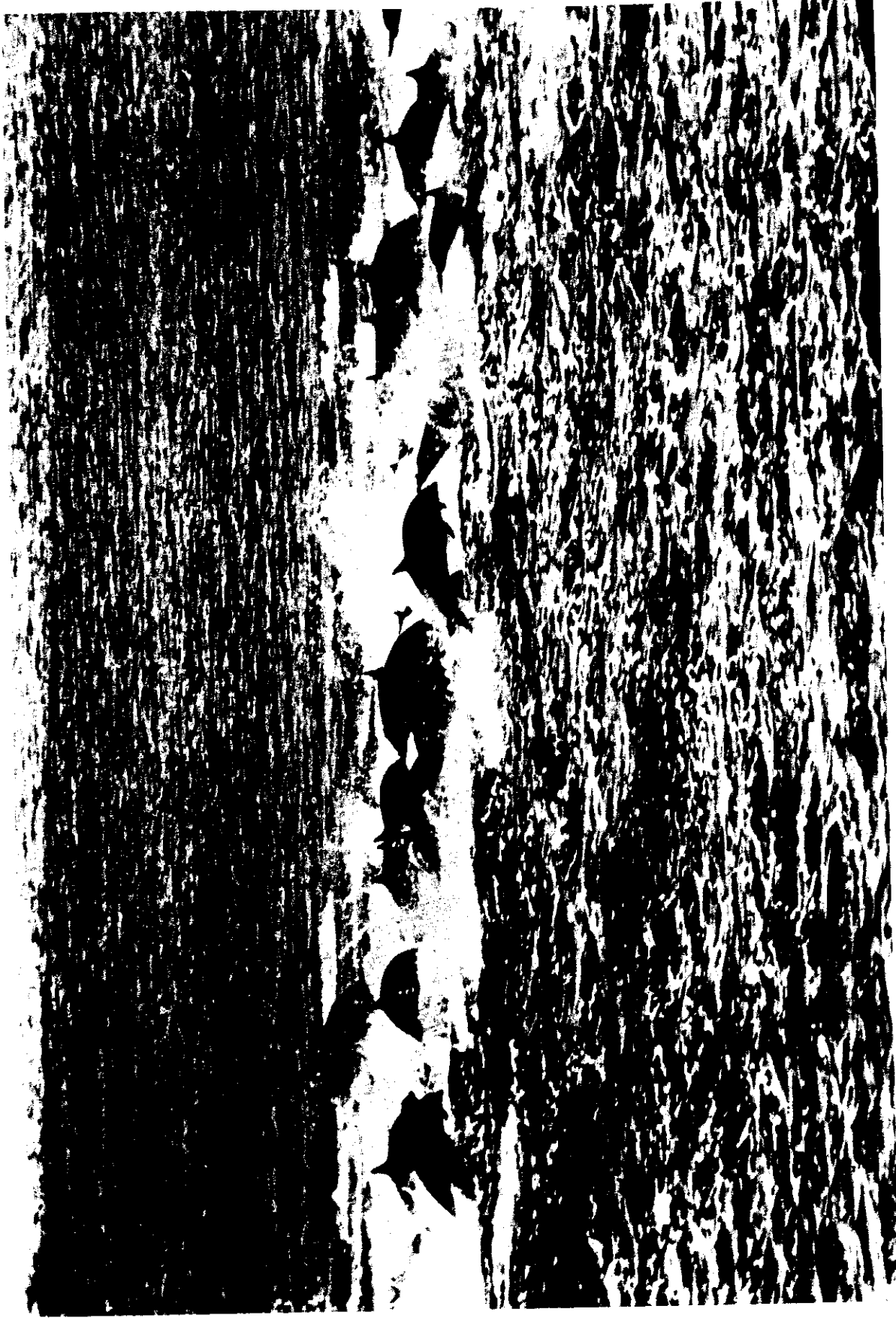
School of Fraser's Porpoise