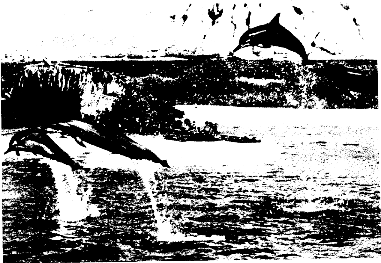
Public display of porpoises - Sea Life Park, Hawaii