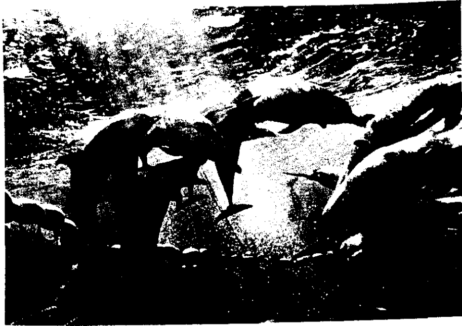
A purse seine net "backing down" under a school of porpoise

Mortality Reduction Technology. During 1977, efforts centered on refining the apron concept and introducing it into widespread use by the tuna fleet. Also, analyses were completed on the 1976, 20-vessel test comparing the performance of an apron/chute system atop a double-depth, fine-mesh porpoise safety panel with the performance of a fine-mesh panel alone. The apron/chute system proved superior to others in allowing porpoise release from the seine during backdown. At the end of 1976, a slight modification of the apron/chute system showed promise of allowing even more-efficient porpoise release. This modification, termed the porpoise or super apron, was voluntarily installed on more than 20 U.S. purse seiners and was required for the entire fleet under the 1978 regulations. NMFS technicians supervised installation and alinement of many of these super aprons both in San Diego and Panama and instructed net makers, in both locations on construction and installation procedures.