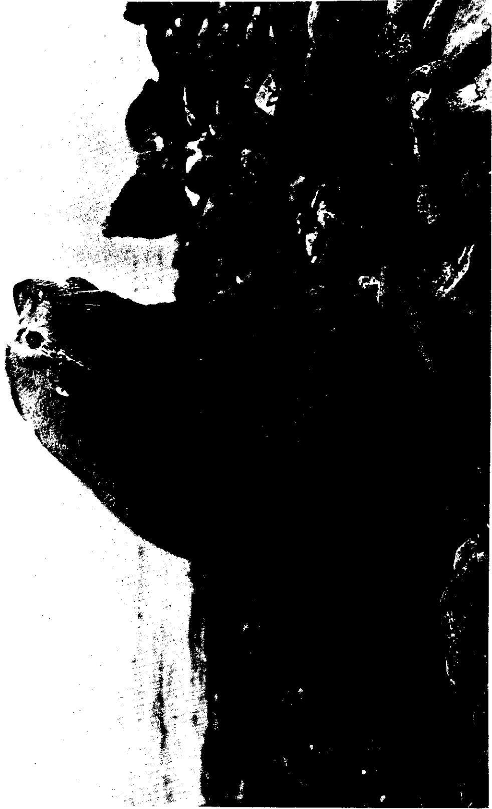
Northern Sea Lion