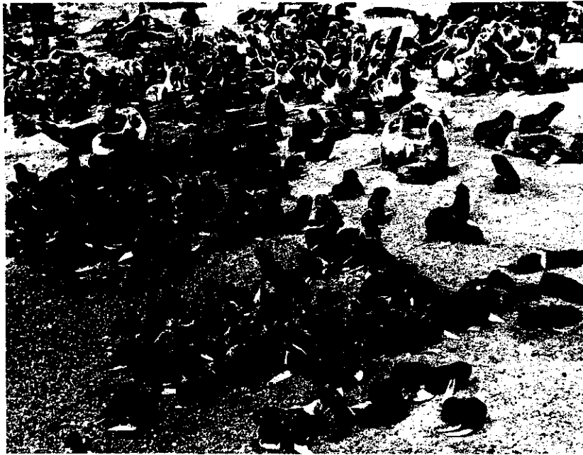
Northern Fur Seals