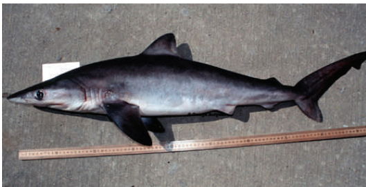
Night shark. Virginia Institute of Marine Science.

A “Species of Concern” is a species or vertebrate population for which there is concern or great uncertainty about its status. Species of Concern are not listed under the Endangered Species Act (ESA) and are not protected by the ESA. NMFS believes it is important to highlight species that could benefit from proactive conservation efforts. NMFS funds grants to states and management agencies, as well as using internal funding to our science centers and regions, to support projects to conserve Species of Concern.