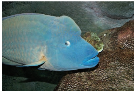
Humphead wrasse.