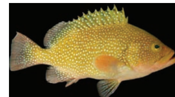
Speckled Hind.

http://www.nmfs.noaa.gov/pr/species/concern