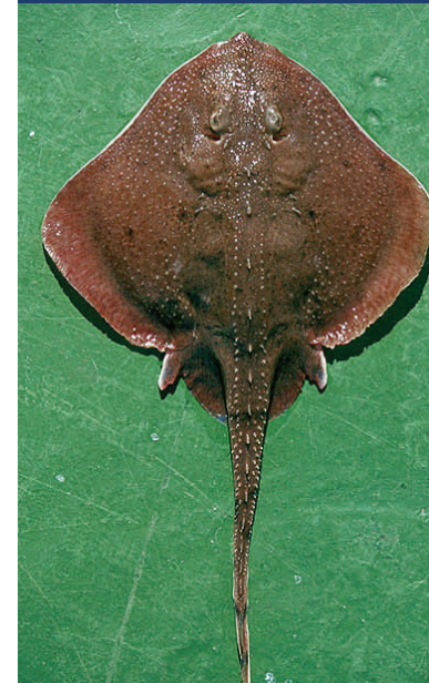
Thorny skate. © Bernd Ueberschaer.