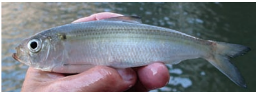
Alewife.