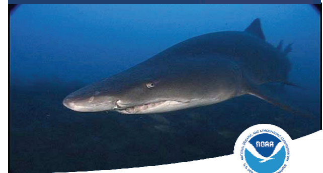
Sand tiger shark