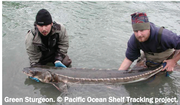
Green Sturgeon.