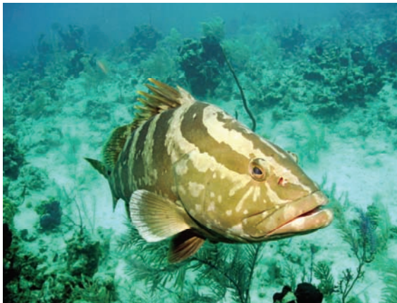
Nassau grouper.