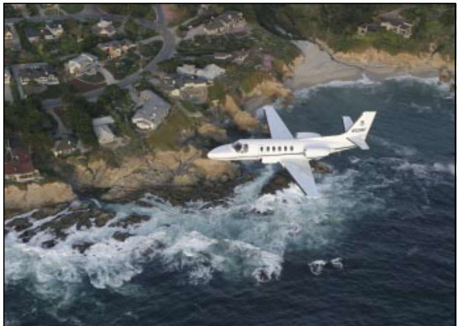
Researchers aboard NOAA’s Cessna Citation II twin-jet aircraft used LIDAR to map the coastline of the Monterey Bay National Marine Sanctuary in April.