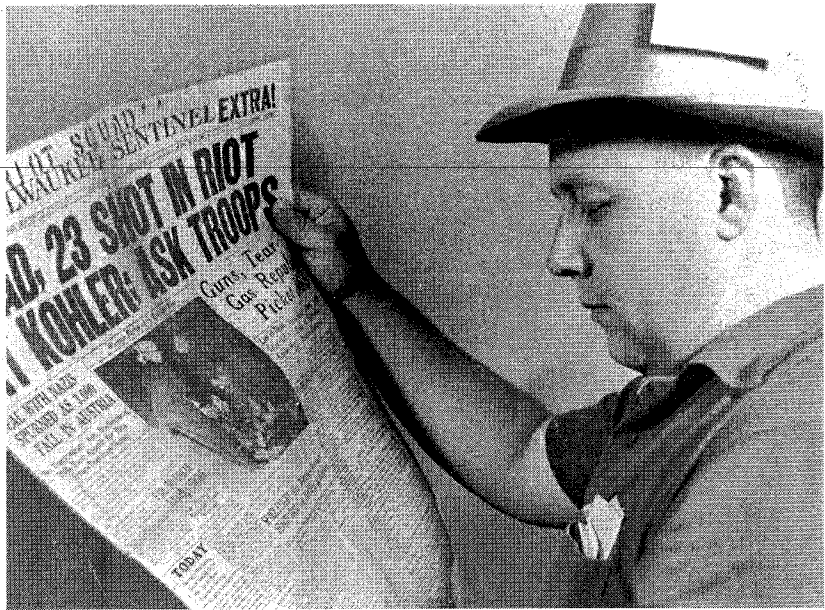
UAW members on picket line during strike against Kohler Co., in Kohler, Wis.

Kohler and the UAW eventually reached settlement in December 1965, in which the company agreed to pay individual workers $3,000,000 in back pay and another $1,500,000 for restoration of pension rights.