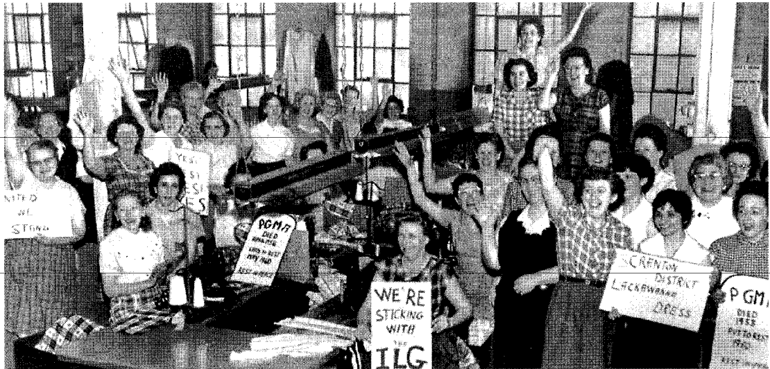
2. Members of Ladies' Garment Workers celebrate election victory at Lackawanna Dress Co., Scranton, Pa., 1960.