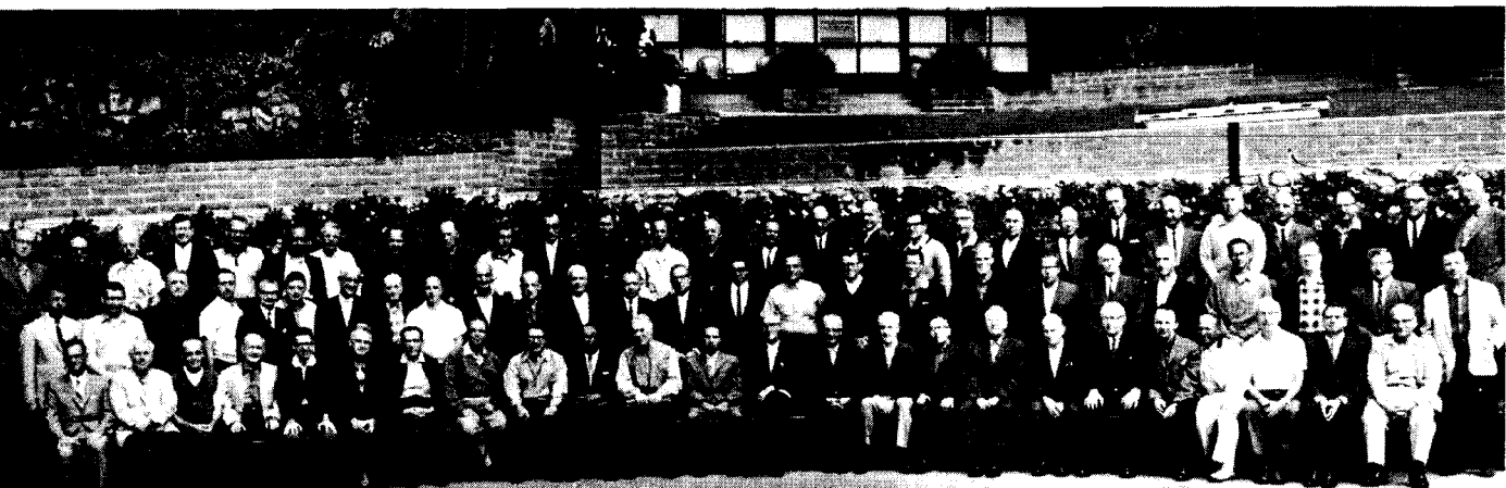
3. General Counsel's Conference, Carmel, Cal., 1964.