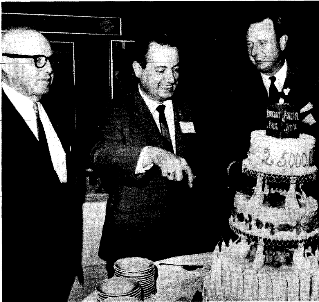
1. President Lyndon B. Johnson, 1966.