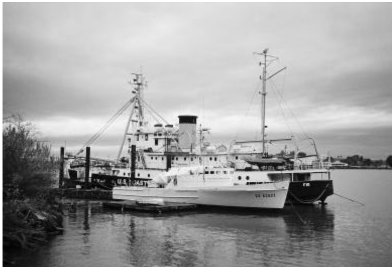
Photo of CG83527 moored in Rio Vista CA

and Anacortes, along with Victoria and Port Alberni in British Columbia will be host ports for the American Sail Training Association’s Tall Ships Challenge 2005