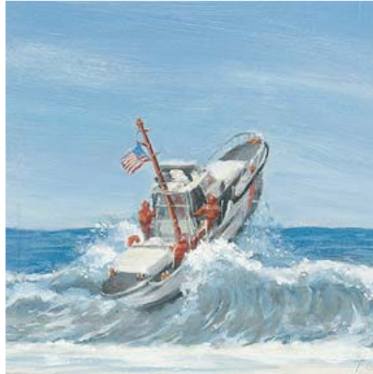
A study for a mural of a 44-foot motor lifeboat, representing 1959-1966

Those with Internet access may visit the class website at: http://raybland.com/cga62/mural to learn more about this project and to view some of the beautiful artwork proposed for the murals.