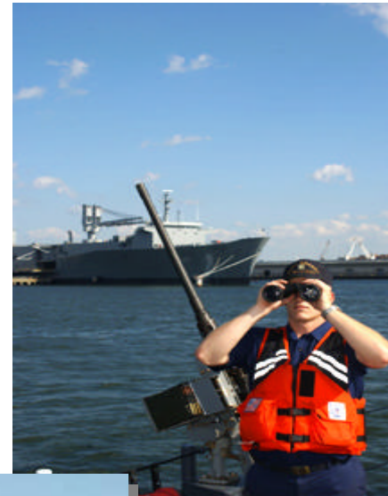
A Crewmember from the Coast Guard Cutter COCHITO, homeported in Little Creek Va., standing lookout watch near Naval Base Norfolk. The Coast Guard is staging its largest port security operation in the 211 years of service.