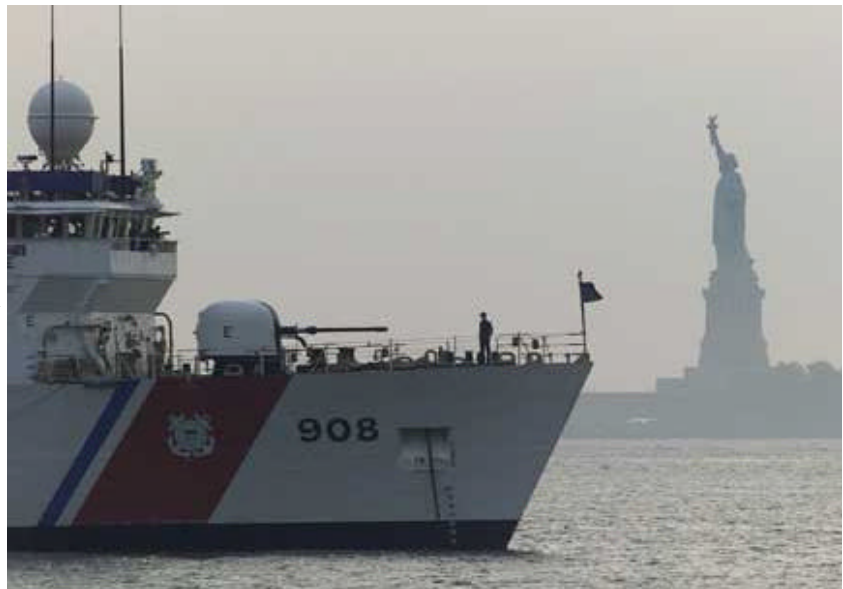
A Coast Guardsman stands watch on the bow of the Coast Guard Cutter Tahoma, anchored off Battery Park, September 23. The crew of the Tahoma is monitoring and controlling vessel traffic in New York Harbor.

The Coast Guard has prepared a number of contingency plans in coordination with U.S. law enforcement and intelligence agencies. It is the Coast Guard's official policy not to discuss any aspect of contingency plans; however, as a military organization the Coast Guard is constantly training and exercising responses to a variety of scenarios.