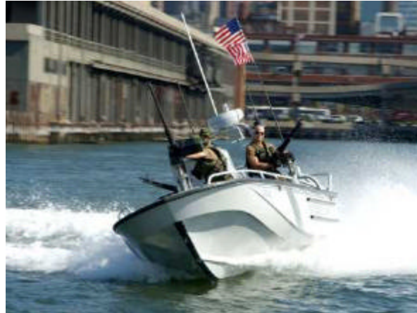
A Coast Guard port security boat races to question a recreational vessel on the Hudson River Wednesday, Sept. 19, 2001, in New York. Coast Guard vessels are deployed around Manhattan to ensure the safety of New York City's waterways.

PORTSMOUTH, Va. – The Coast Guard remains at its highest state of alert and readiness since World War II, one day after the president authorized military action against the terrorist regime in Afghanistan.