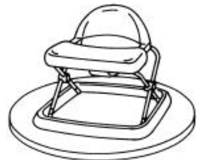
Too wide to fit through doorway.