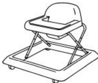
Features, such as a gripping mechanism, stop walker at edge of step.