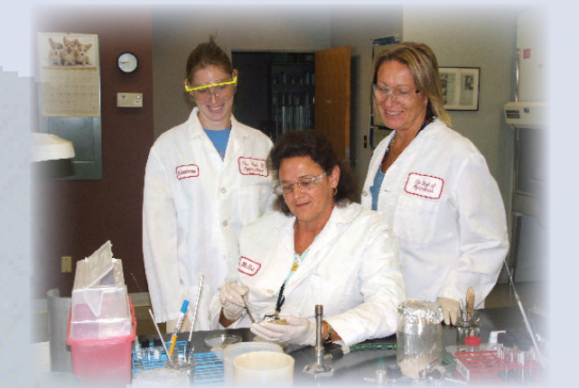
Kissimmee Diagnostic Laboratory, Kissimmee, FL

Key elements of the NAHLN system include increased and more flexible capacity for laboratory