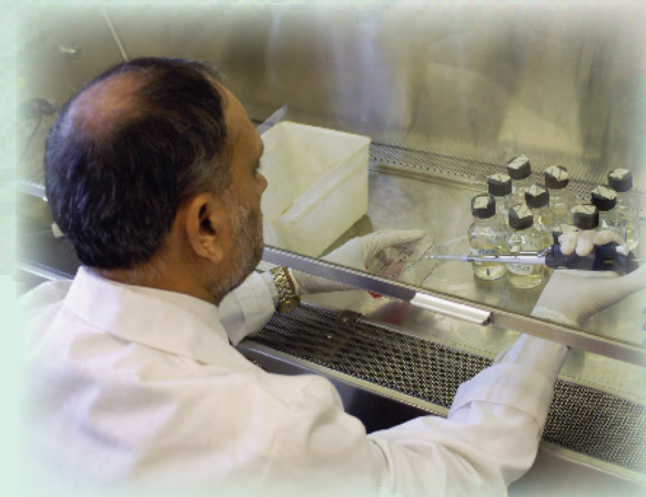
Minnesota Veterinary Diagnostic Laboratory, St. Paul, MN

The State/university laboratories in the NAHLN perform routine diagnostic tests for endemic animal diseases as well as targeted surveillance and response testing for foreign animal diseases. State/university laboratories also participate in the development of new assay methodologies.