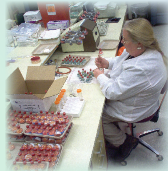
Purdue University Animal Disease Diagnostic Laboratory, West Lafayette, IN

A “train the trainer” program has been developed by NVSL and implemented to increase the number of laboratories with personnel trained to conduct the assays for diagnosing AI, END, CSF, and FMD. This program not only has increased the number of laboratory personnel prepared to respond to a national animal-health emergency but has also provided the United States with a cadre of trainers available to teach others when needed. The successful implementation of this program is a significant step for the NAHLN in achieving its goals of sufficient diagnostic capability and capacity to address an animal-health emergency.