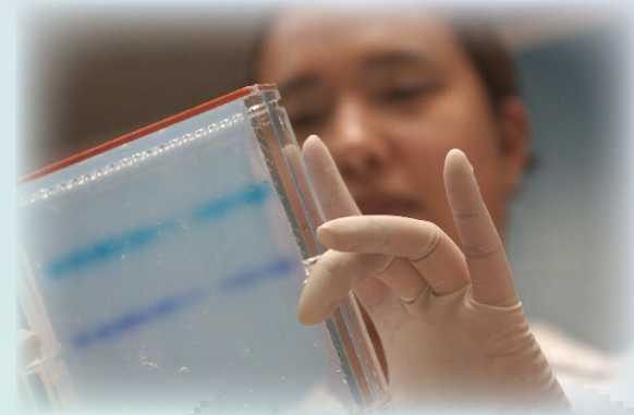
Ohio Department of Agriculture, Reynoldsburg, OH