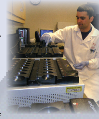
Animal Disease Research and Diagnostic Laboratory, Brookings, SD

Networking these resources provides an extensive infrastructure of facilities, equipment, and personnel that are geographically accessible no matter where disease strikes. The laboratories have the capability and capacity to conduct nationwide surveillance testing for the early detection of an animal disease outbreak. They are able to test large numbers of samples rapidly during an outbreak and to demonstrate freedom from disease after eradication.